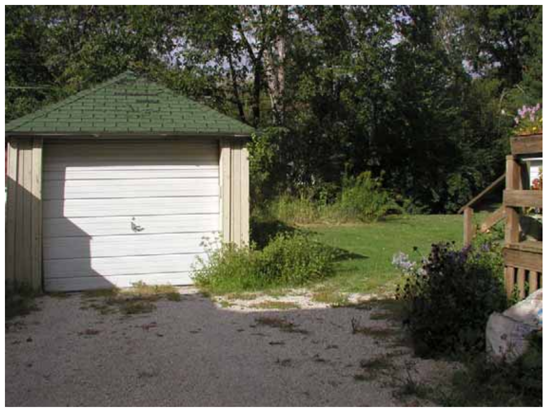
Looking northeast towards garage, deck and backyard