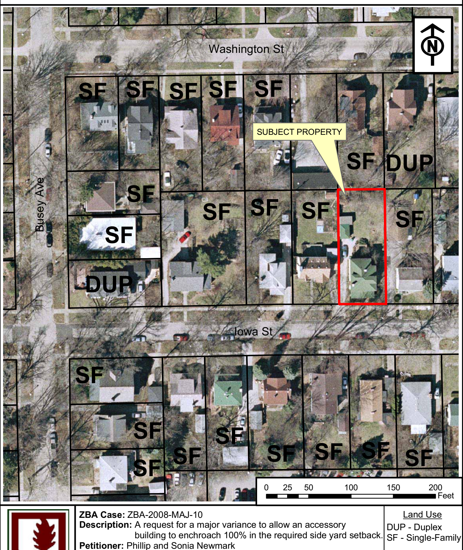
Exhibit A: Location and Existing Land Use Map

Location: 706 West Iowa Street Zoning: R-2, Single-Family Residential