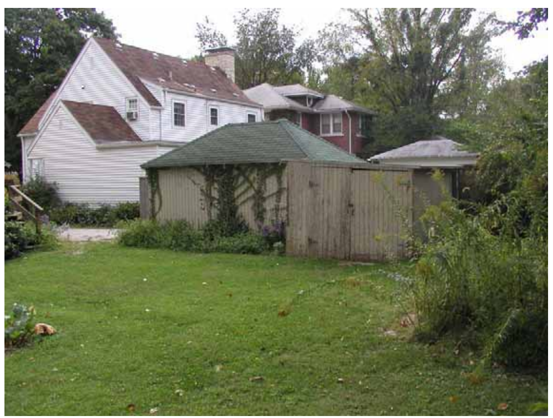
Looking southwest towards garage and adjacent property