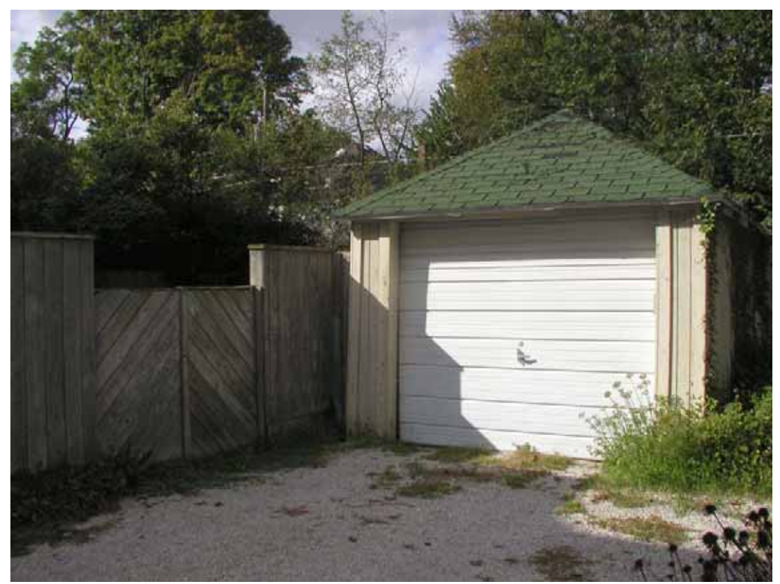
Looking northwest towards garage and adjacent property