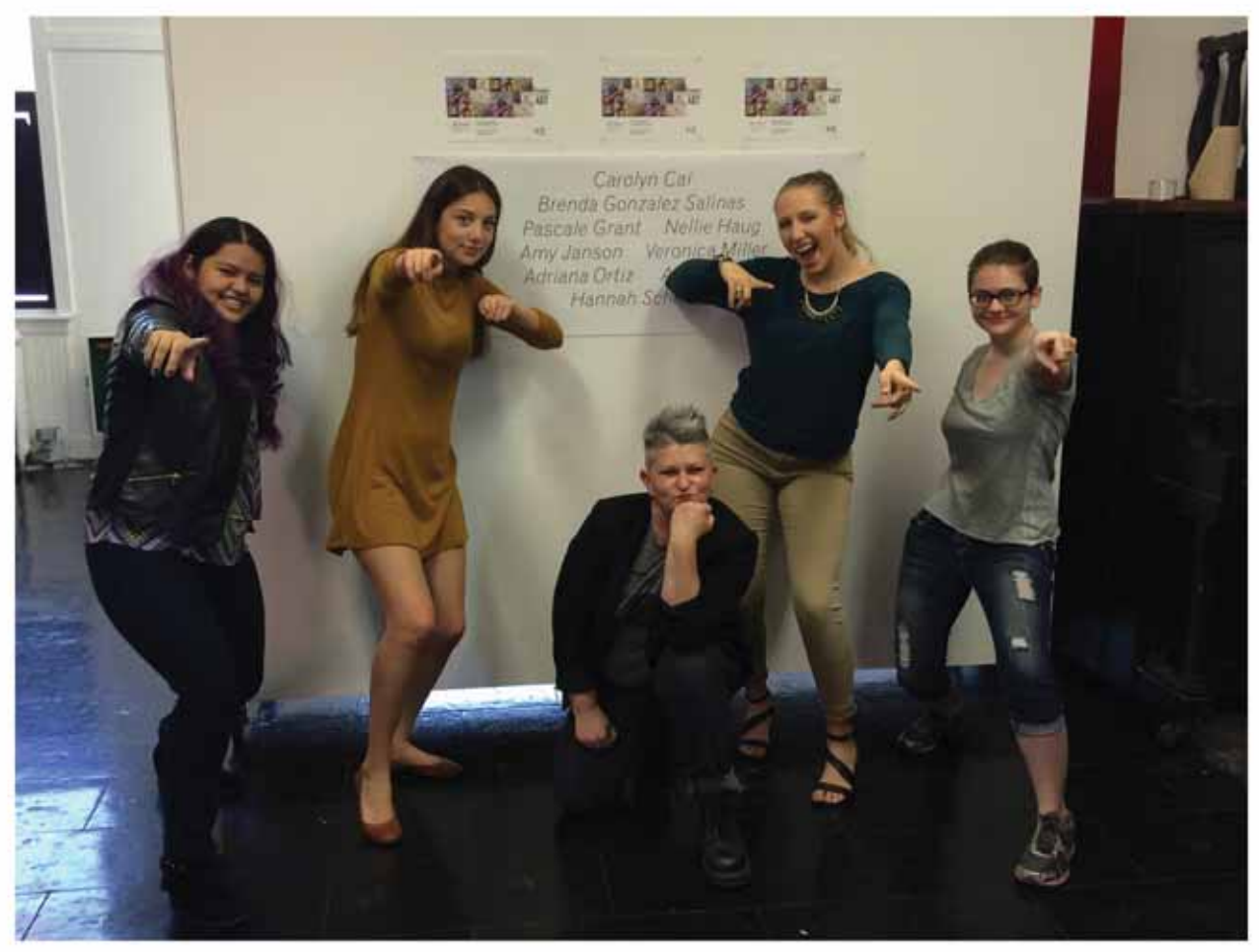
Centennial Highschool Students, Art Under Pressure