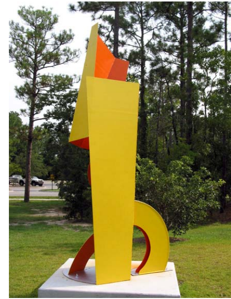
2. Prism Arc VI by Carl Billingsley, painted steel, 4' x 4' x 9.5'H, for the NE corner of Philo and Colorado