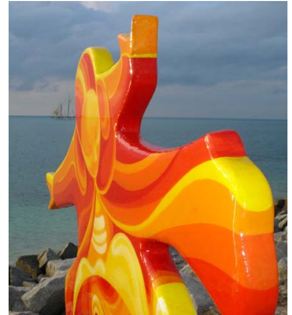
3. Landing by Cecilia Lueza, stainless steel, urethane, paint, epoxy, 58" x 2" x 77" H, for SE corner of Philo Road and Florida Avenue