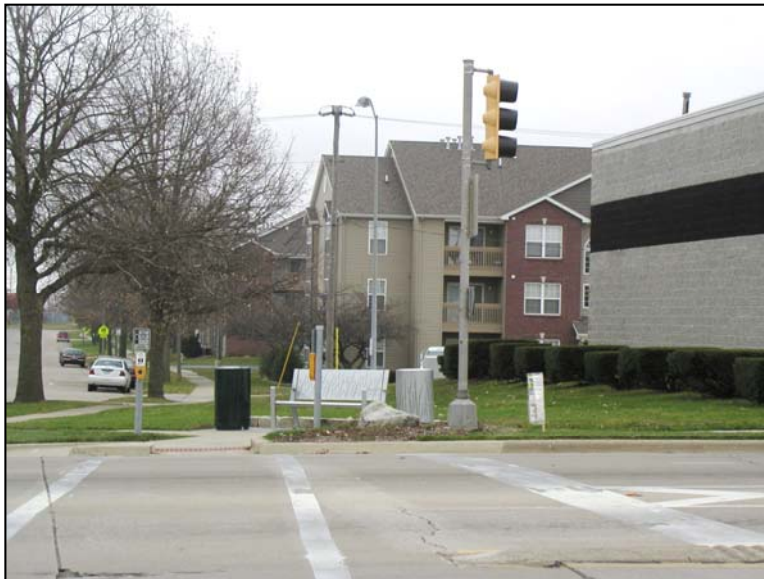
Philo Road location: Corner of Florida Avenue and Philo Road