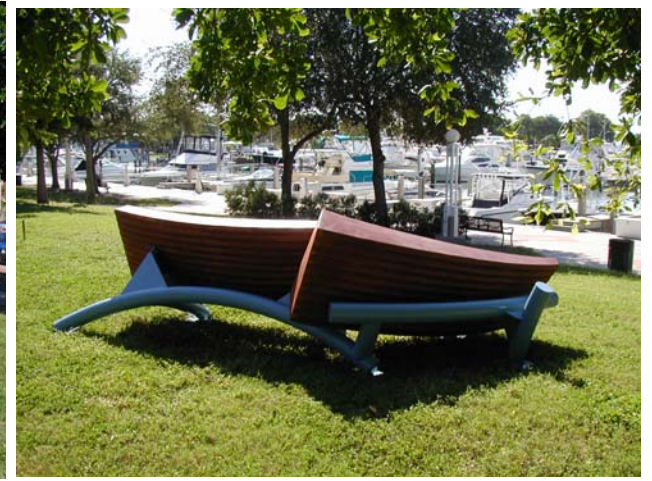
4. Bench 9 by Barry Hehemann, steel, concrete, 14'8" x 6'8" x 3'8" H, for the mid-corridor Philo Road site