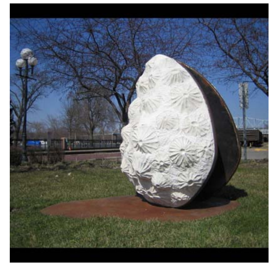
2a. Barnacle by Kari Reardon, steel, concrete, 5' x 4' x 8' H, for SE corner of Philo and Florida Ave, and Philo Road mid-corridor location