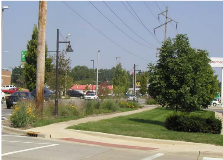
Philo Road location: Corner of Colorado Avenue and Philo Road