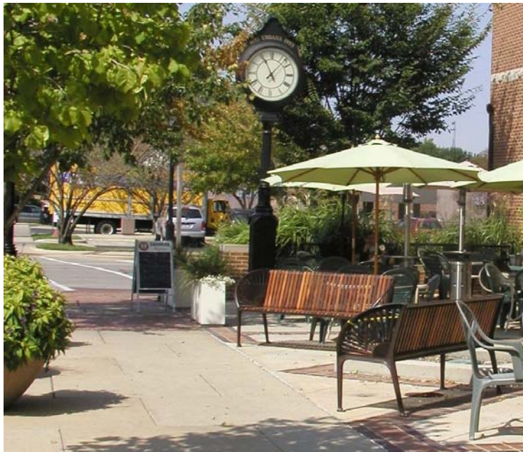
Iron Post Courtyard location

The Philo Road Business Corridor location includes sites for up to three sculpture pieces as part of a newly implemented streetscape beautification project on Philo Road between Florida and Colorado Avenues. Philo Road is a mixed-use business corridor adjacent to high-density and single family residential properties. Recent streetscape beautification with a prairie theme has included significant landscaping, new pedestrian and traffic lighting, bike lanes, and benches. The submitted artwork was encouraged to explore or express a theme of sustainability or of the prairie; for example the work could express ideas of human interaction with the environment or native fauna or flora of the Illinois prairie in its design. Again, while this theme was encouraged, artwork outside this theme was also considered. The artwork will be installed in three locations along the Philo Road Corridor. Two of these locations are on public-right-of-way property and are confirmed. The third location is currently being negotiated with property owners. Images of the confirmed locations are below. Appropriate bases and installation methods will be determined by the artist in coordination with City of Urbana personnel. Proposed artwork was requested to fall within the maximum dimensions of 60" x 60" at ground base; however, larger pieces were also considered.