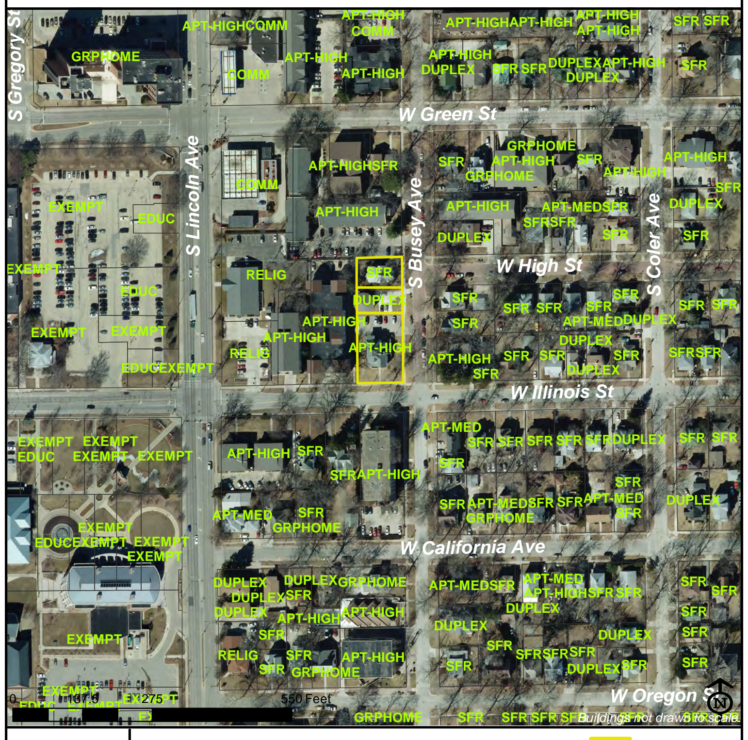
Exhibit A: Location & Existing Land Use Map