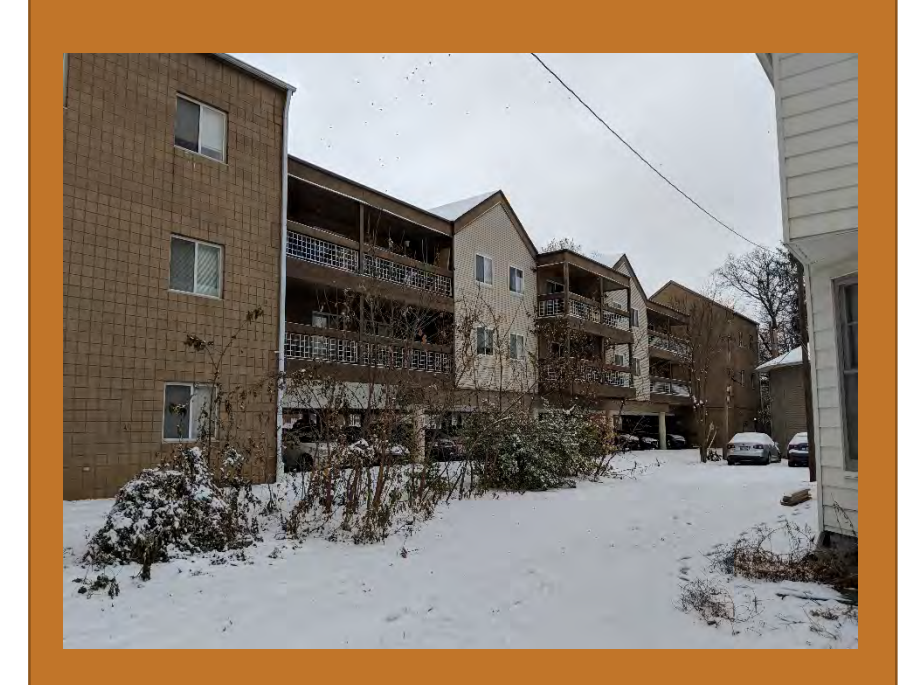
802 W Illinois Street. Same structure as 403 S Busey Avenue.