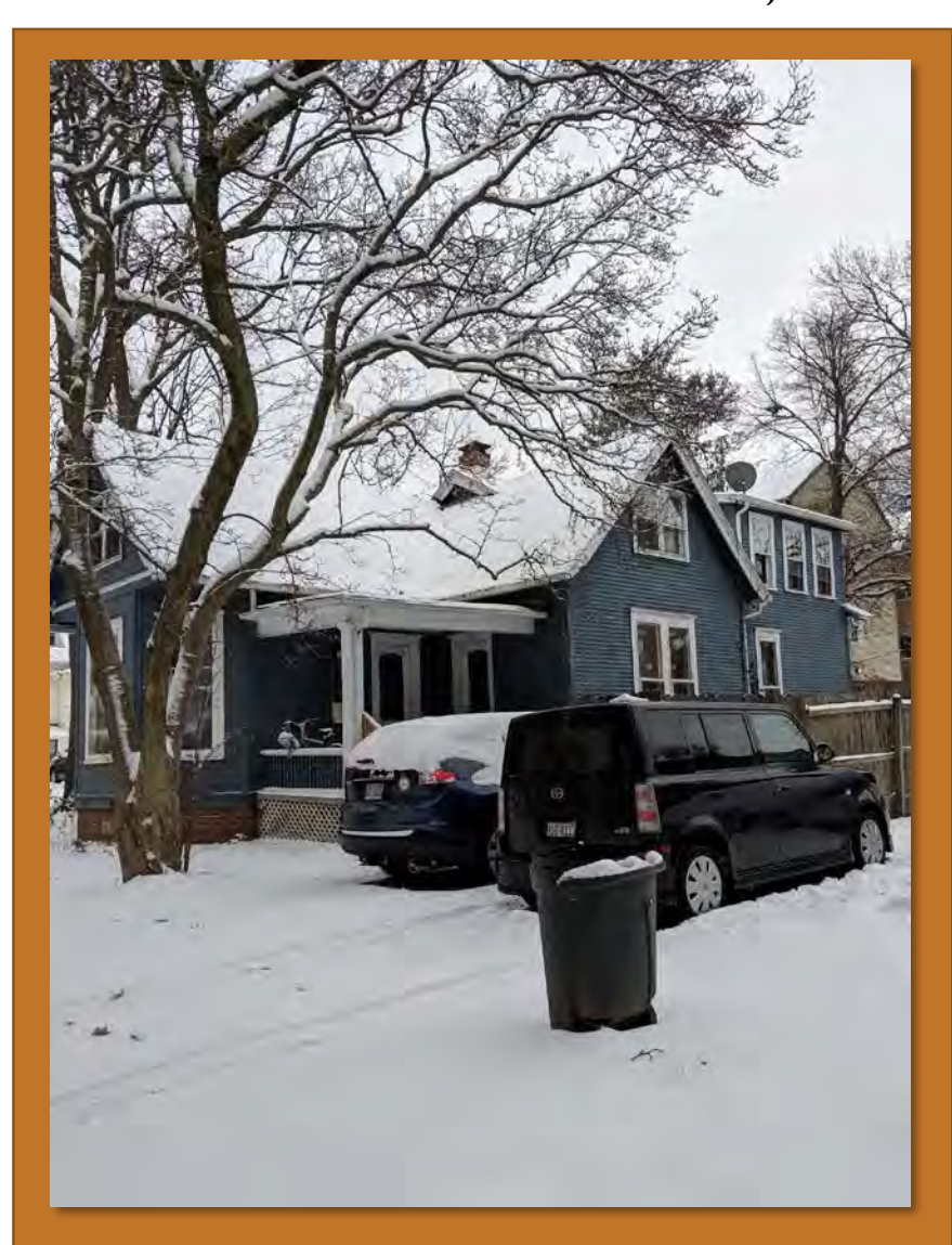
307 S Busey Avenue. Current zoning is R-4.