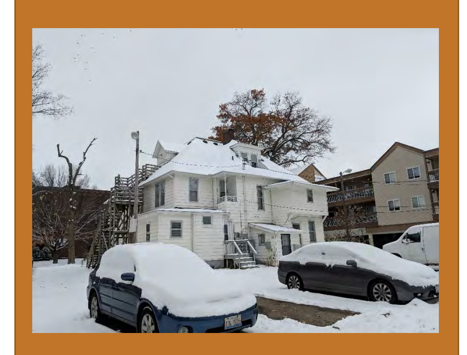
401 S Busey Avenue.