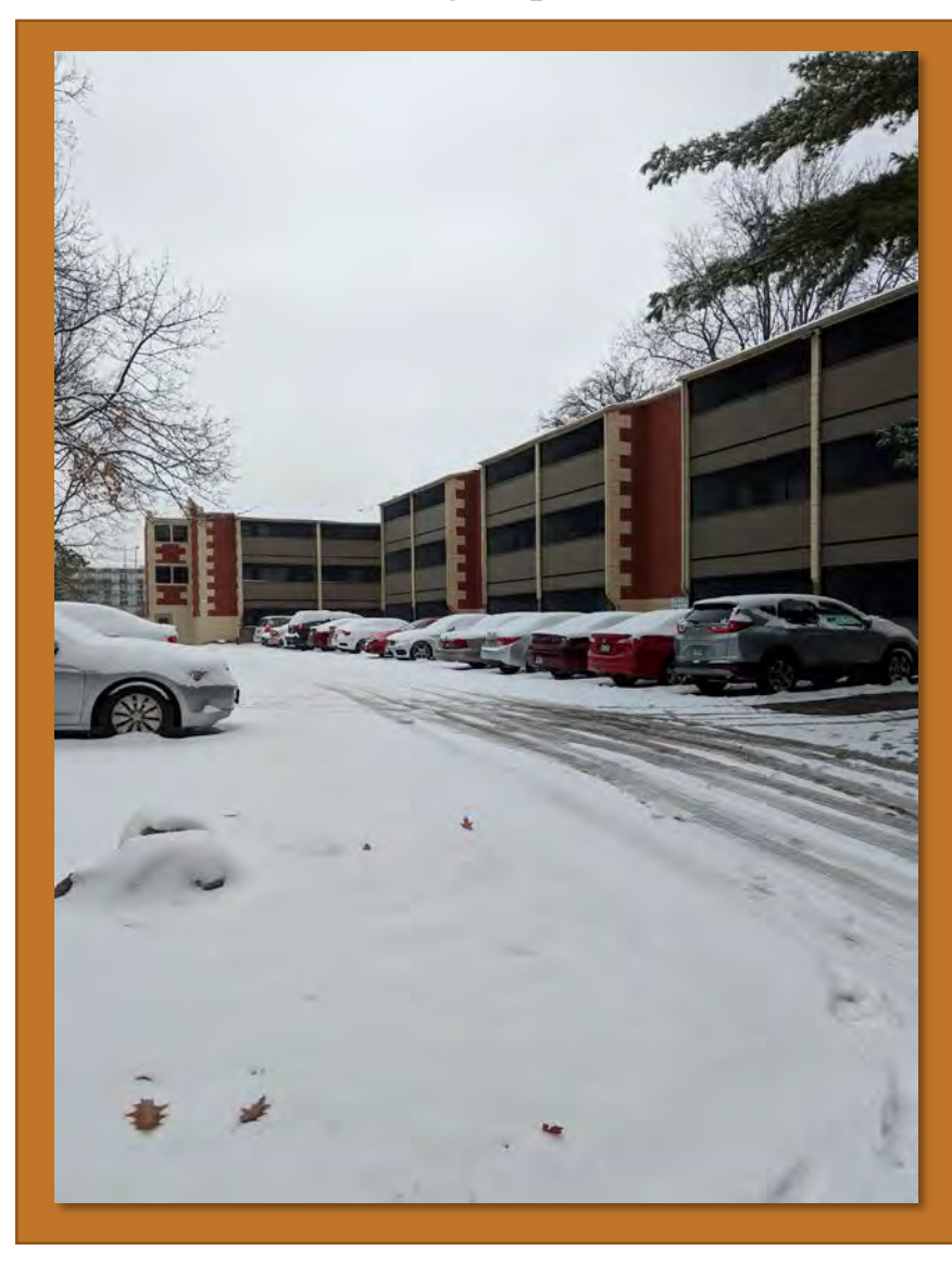
Property to the north of subject area. Properties directly north are R-5.