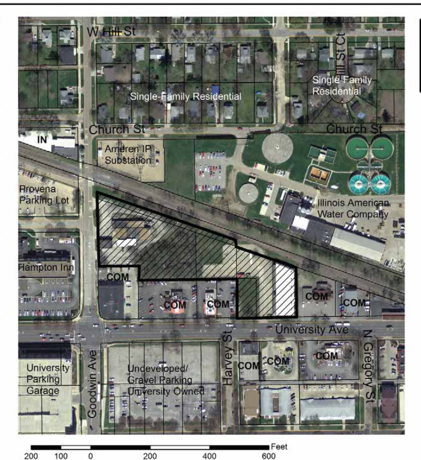
Exhibit A: Location & Land Use Map