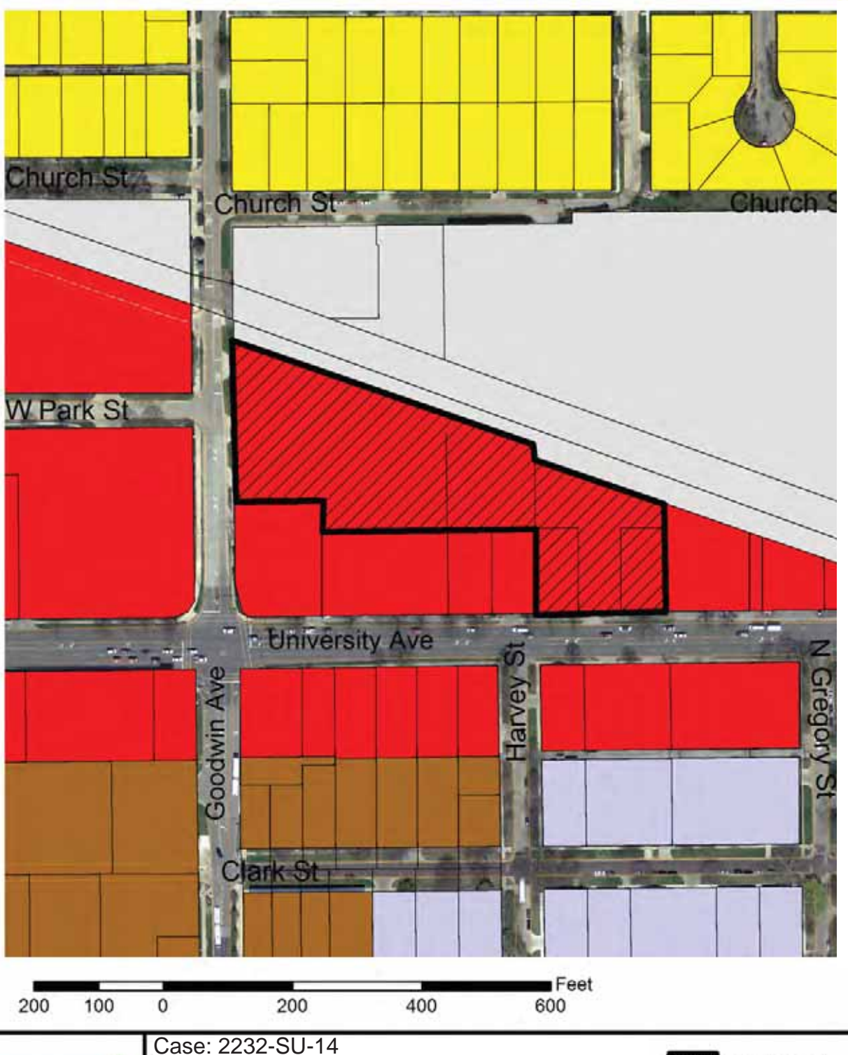
Exhibit B: Zoning Map