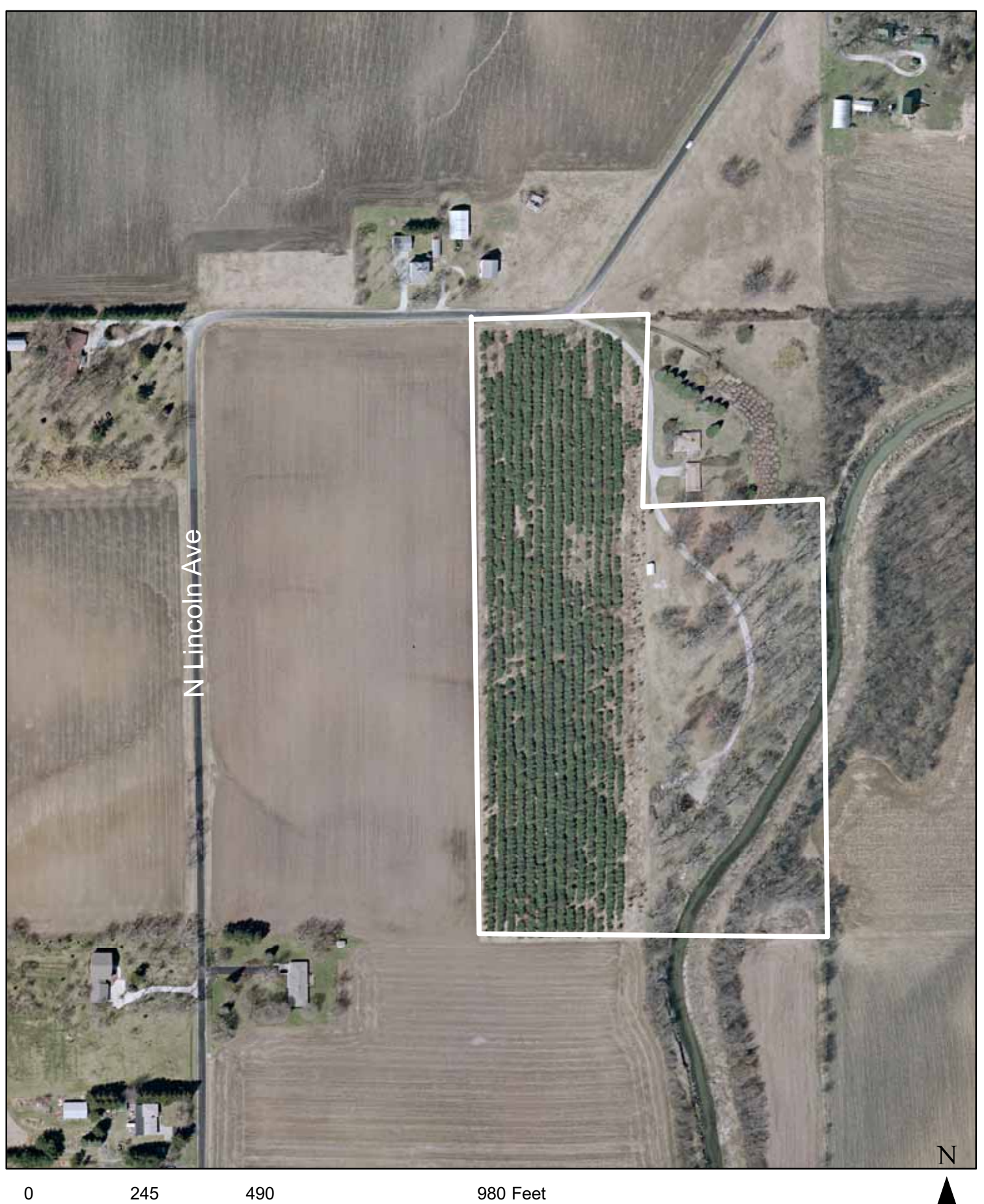
Exhibit B: Aerial Photo