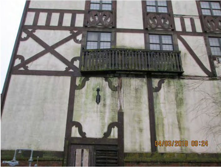
EXHIBIT D - LETTER FROM BUILDING SAFETY DIVISION