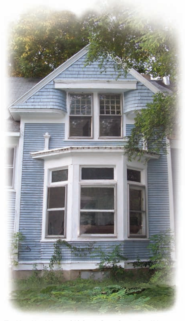
The Mary Lloyd House, 210 South Grove Street, East Urbana