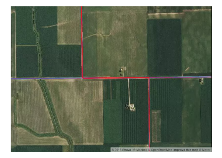
Race St extended at Cnty Hwy 18

In most cases, a 4-foot shoulder with a rumble strip would be sufficient to provide a safer alternative on highways with little or no shoulder. The portion of 150 west of Mahomet, with no shoulder, was originally planned to be repaved with 3-foot shoulders, but IDOT has agreed to provide the 4-foot shoulders instead.