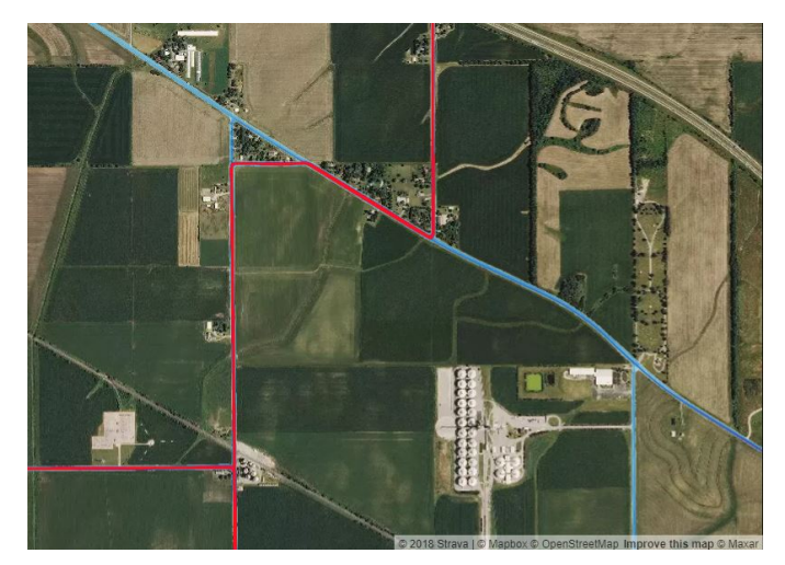
Rising Rd at 150