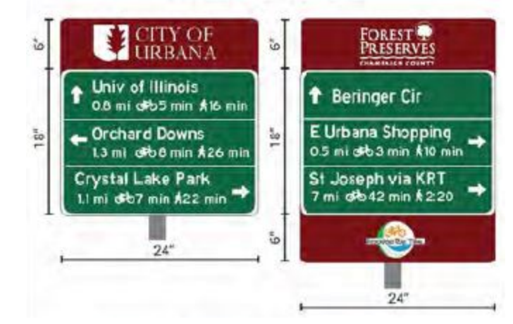
Figure 5-7 Confirmation Signs for Off-Street Trails

Installation of bikeway and trail wayfinding signs was a specific goal of the 2016 BMP, and several other BMP goals will be advanced once the plan is implemented, such as safety improvements, continuity of routes, bike access to employers, and establishing a "Green Loop" trail.