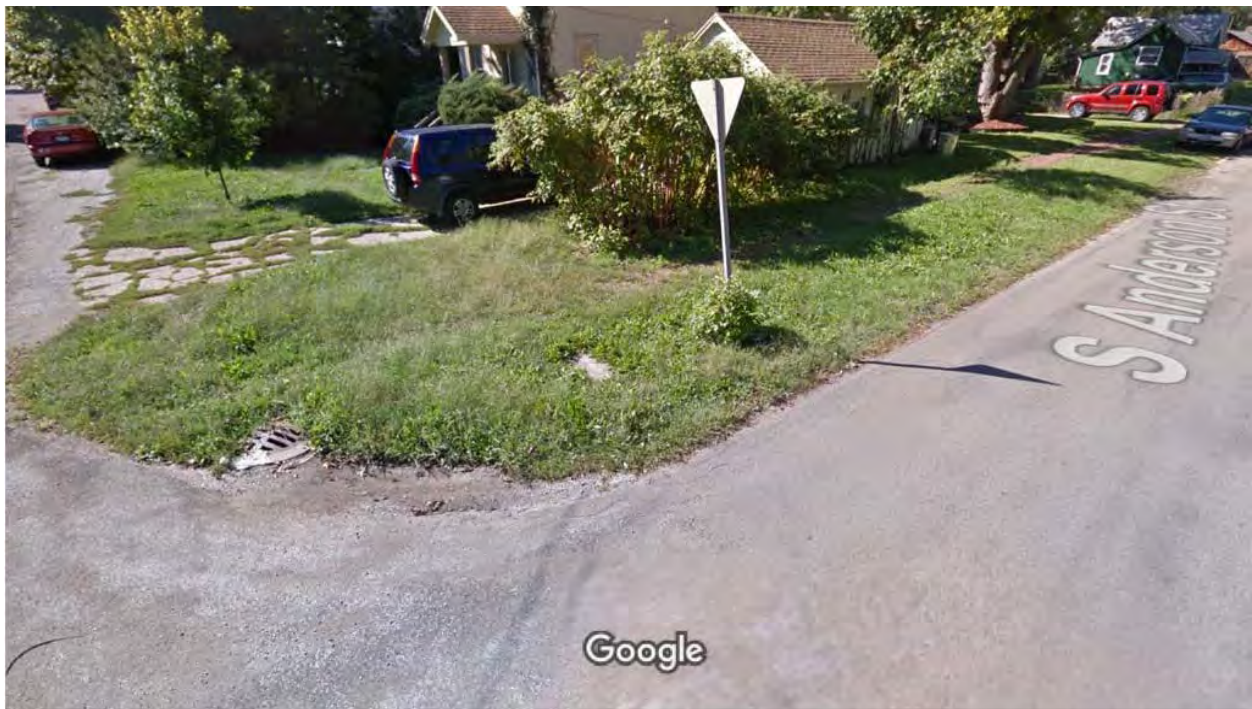
Picture of Brick Sidewalk on Anderson Street at High Street looking North