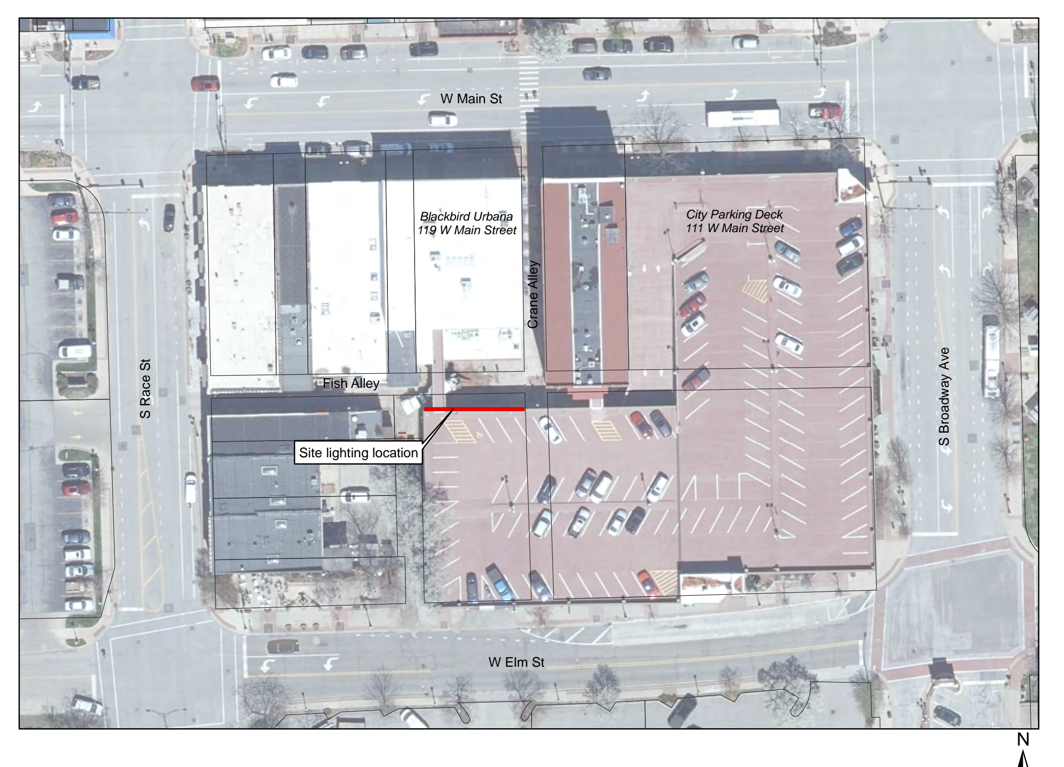
EXHIBIT A - LOCATION MAP