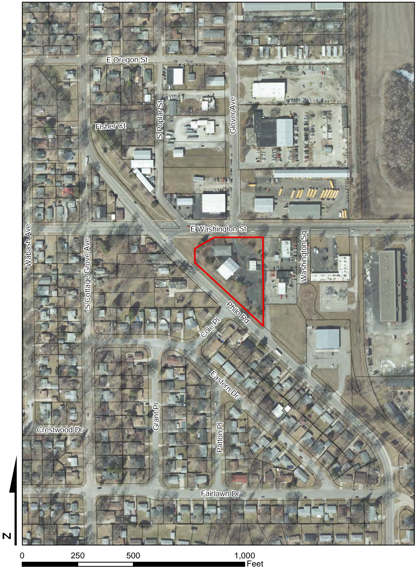
Exhibit B: Property Location Map -1301 E Washington St