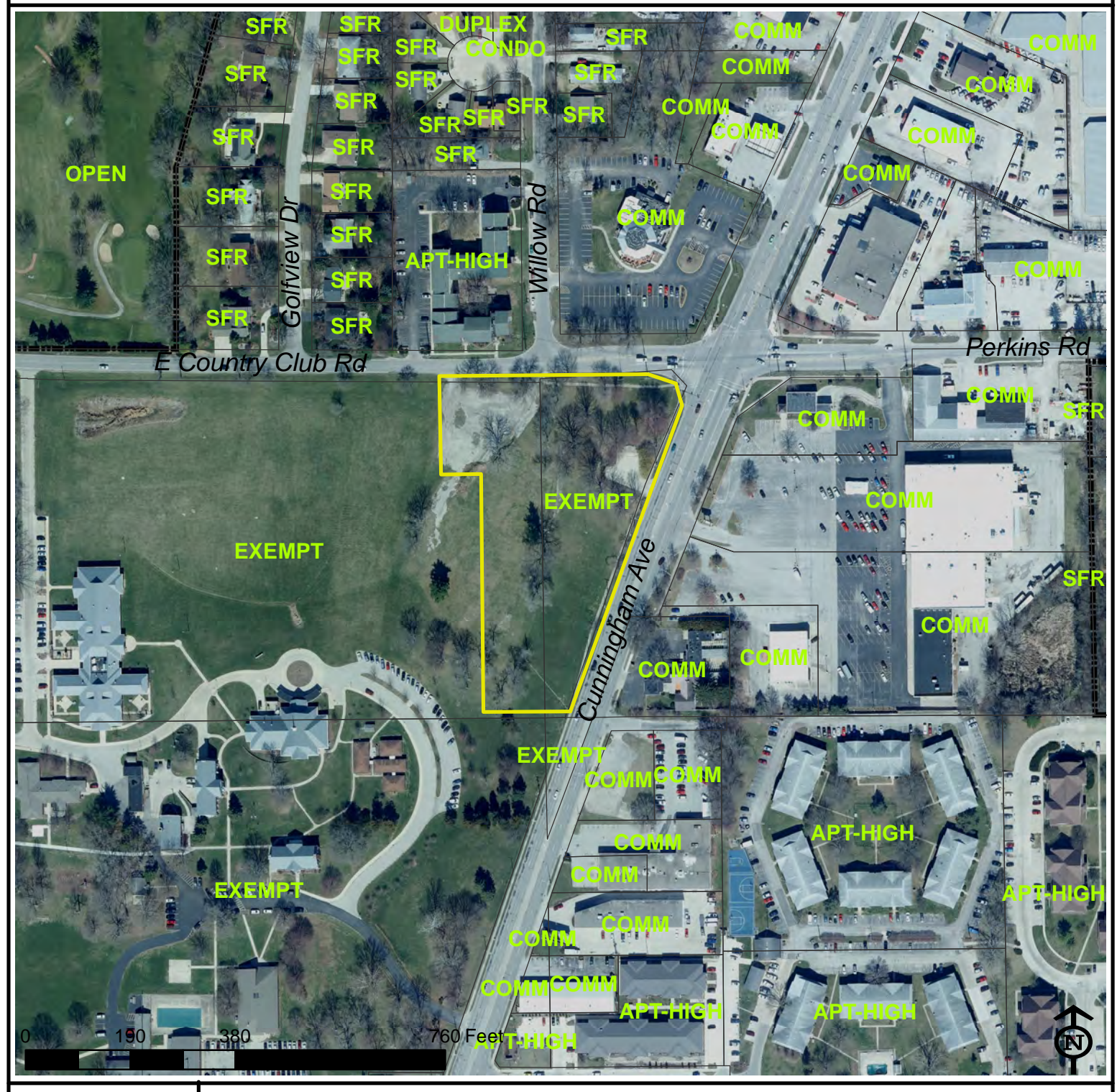
Exhibit A: Location & Existing Land Use Map