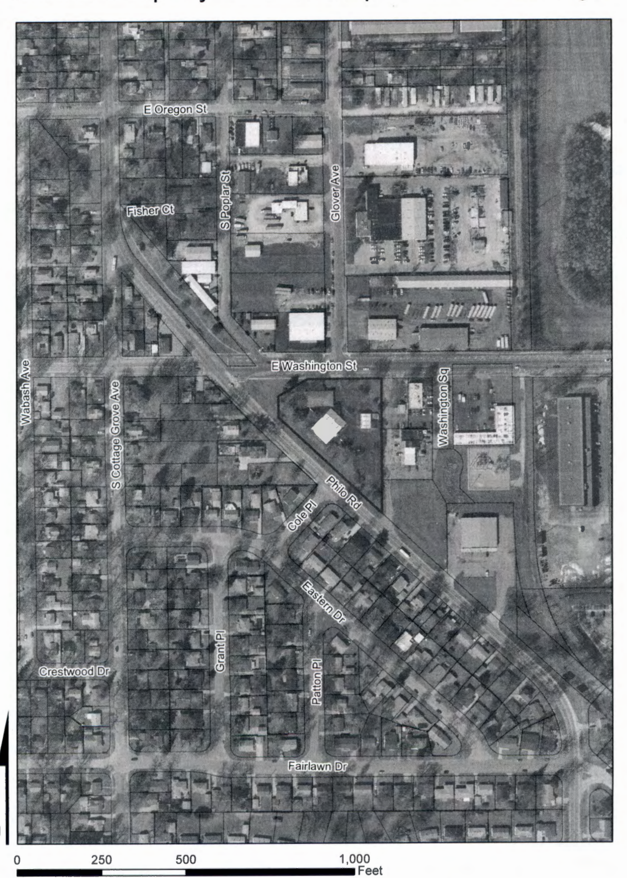
Exhibit B: Property Location Map -1301 E Washington St