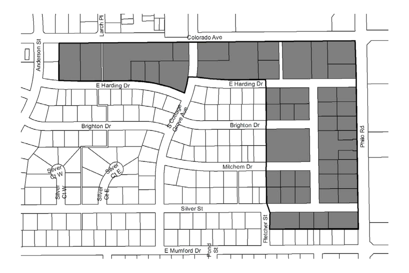
Figure XIII-1 Southeast Urbana Overlay District