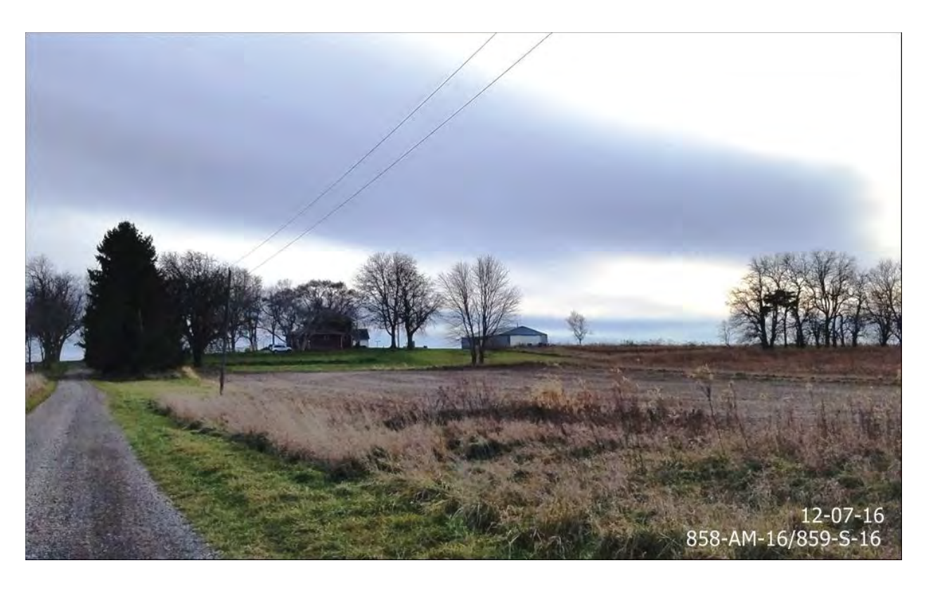
Subject property, from driveway off Old Church Road, facing south-southwest