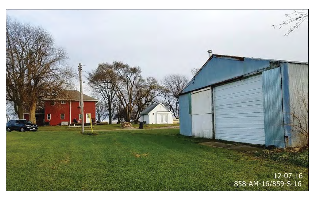
Subject property, proposed Events Center is barn on right