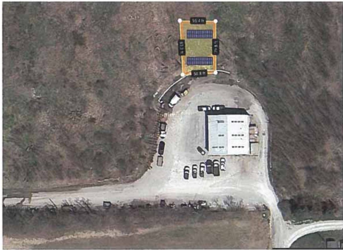
Figure 1 - the Site

The site is located at 1210 E. University Avenue in the City of Urbana, IL.