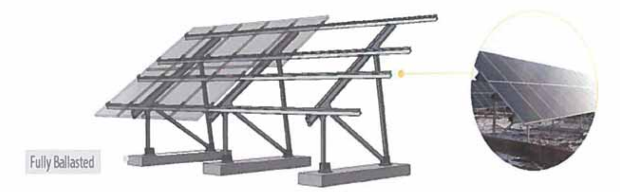
Figure 4 – Fully Ballasted Ground Mounting System

The mounting system will be fully ballasted ground mounting system.