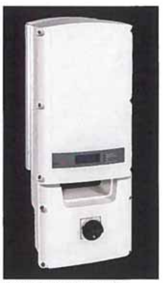
Figure 3 - SolarEdge SE11400A-US Grid Tied Inverter