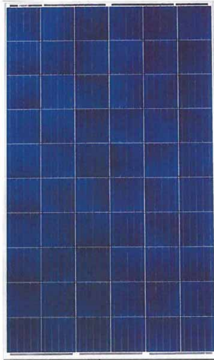
Figure 2 – CSUN 310W panels