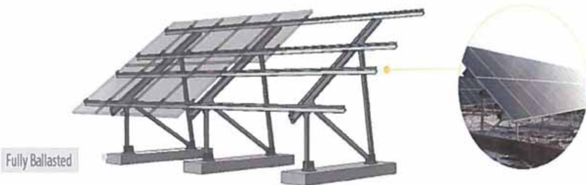
Figure 4 – Fully Ballasted Ground Mounting System

The mounting system will be fully ballasted ground mounting system .