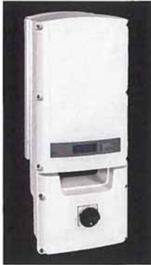
Figure 3 - SolarEdge SE11400A-US Grid Tied Inverter