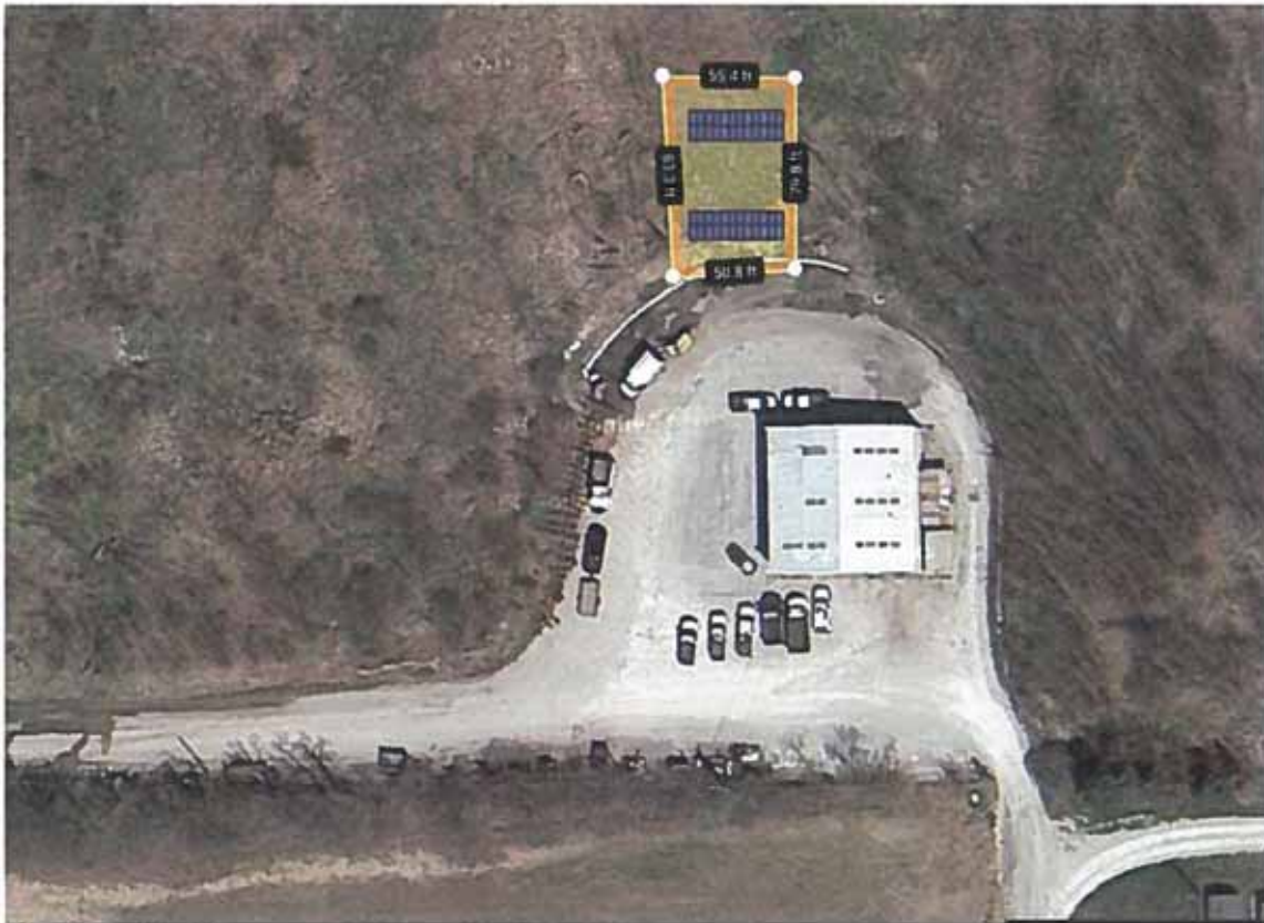
Figure 1 - the Site

The site is located at 1210 E. University Avenue in the City of Urbana, IL.