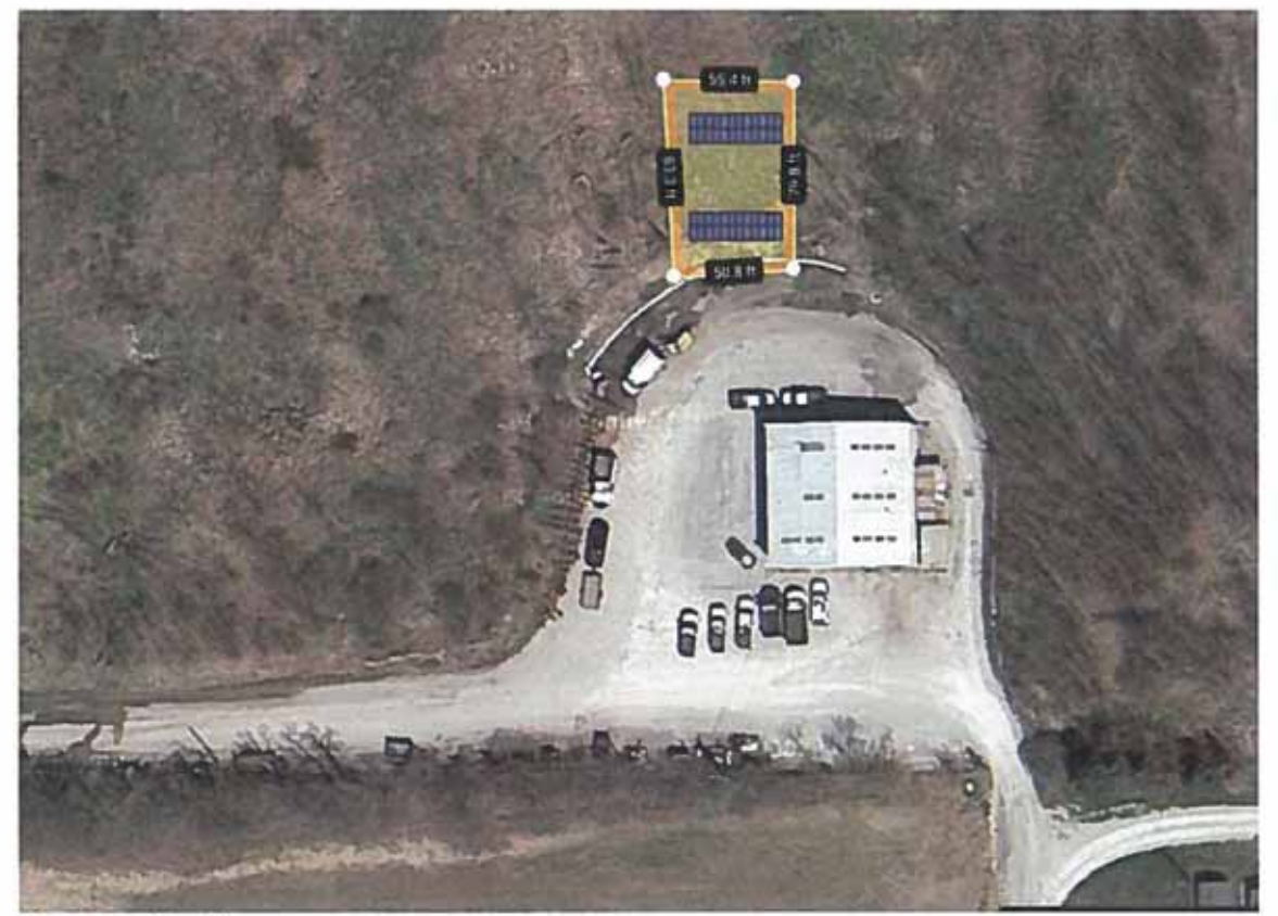
Figure 1 - the Site

The site is located at 1210 E. University Avenue in the City of Urbana, IL.