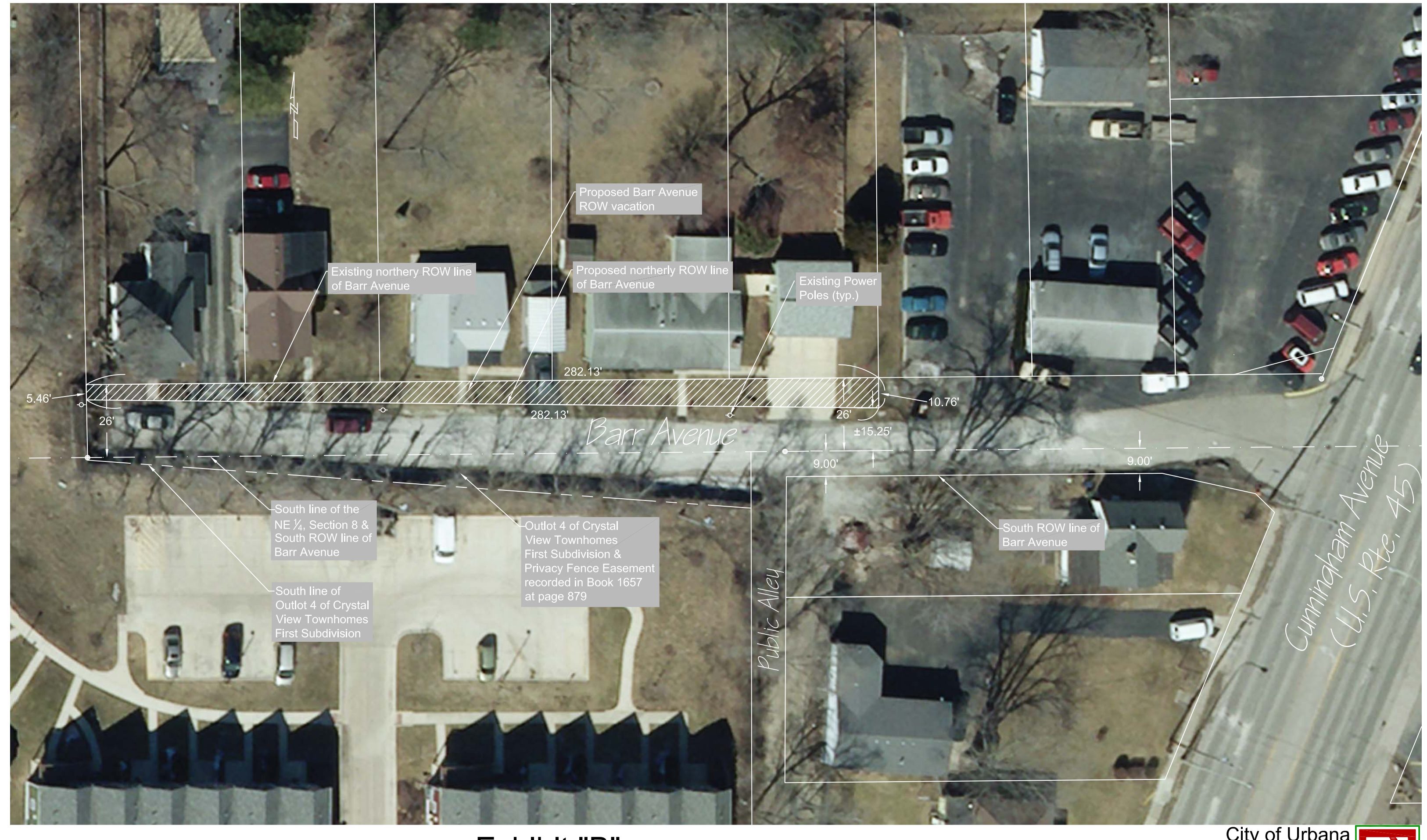
Exhibit "B" Proposed Street ROW Vacation Map