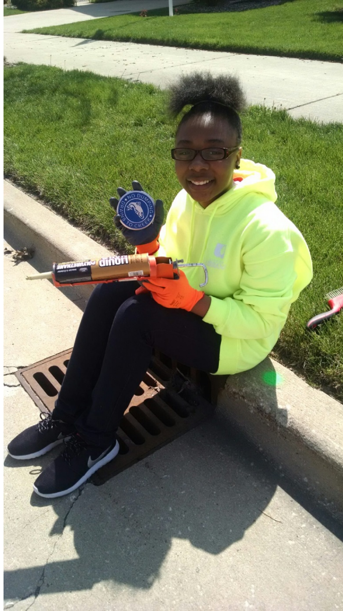
Photo of Storm Sewer Medallion Installation