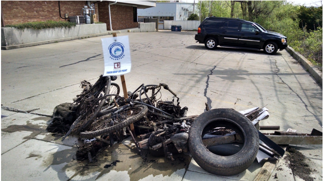
Photo of Trash Collected from Boneyard Creek