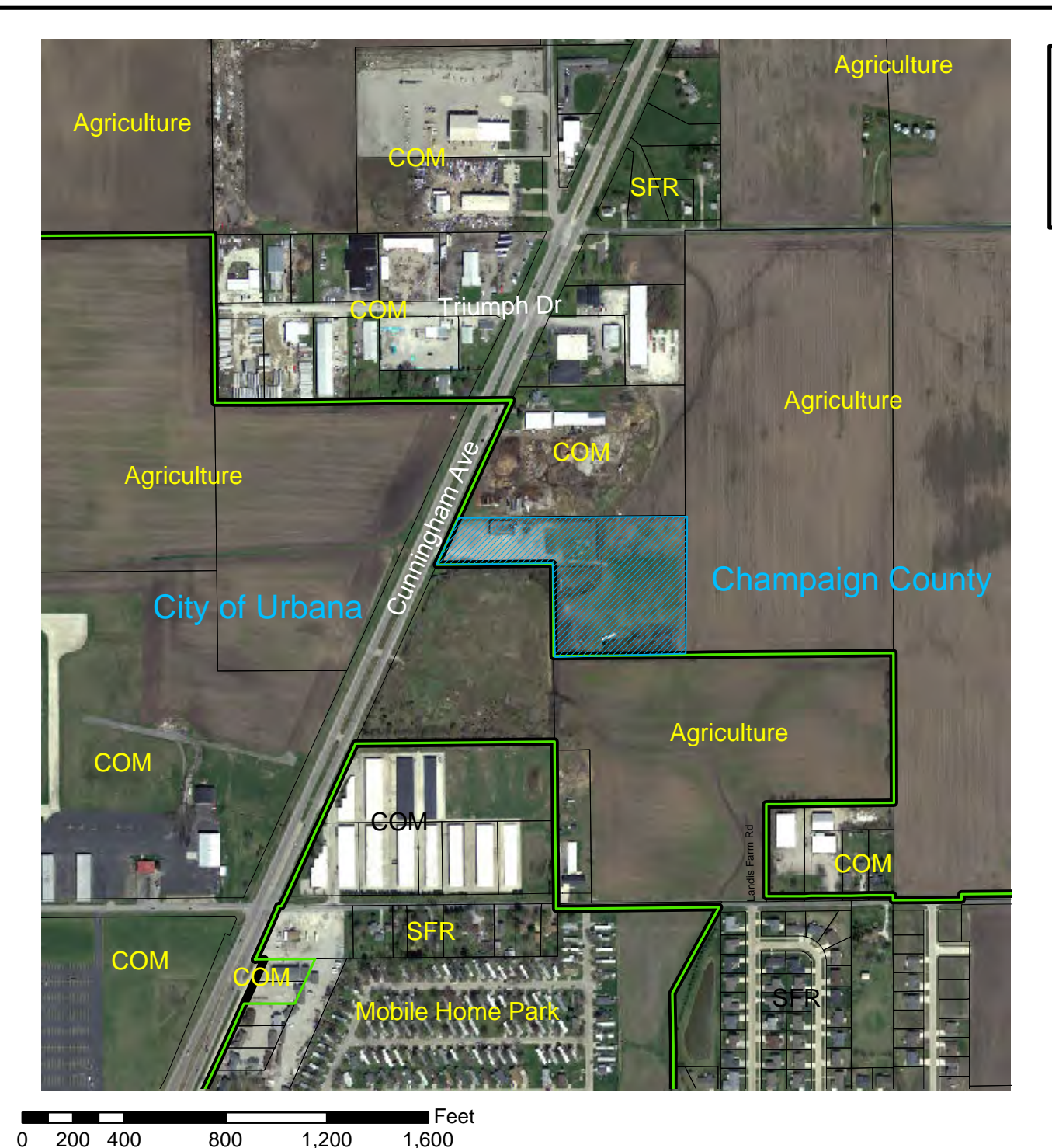
EXHIBIT A: Location & Existing Land Use Map