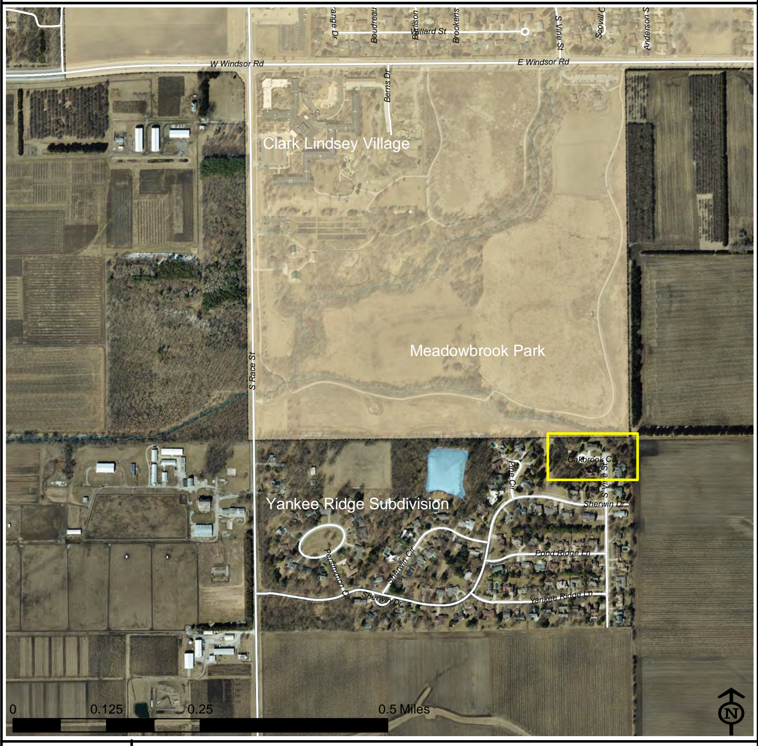
Exhibit A: Location Map