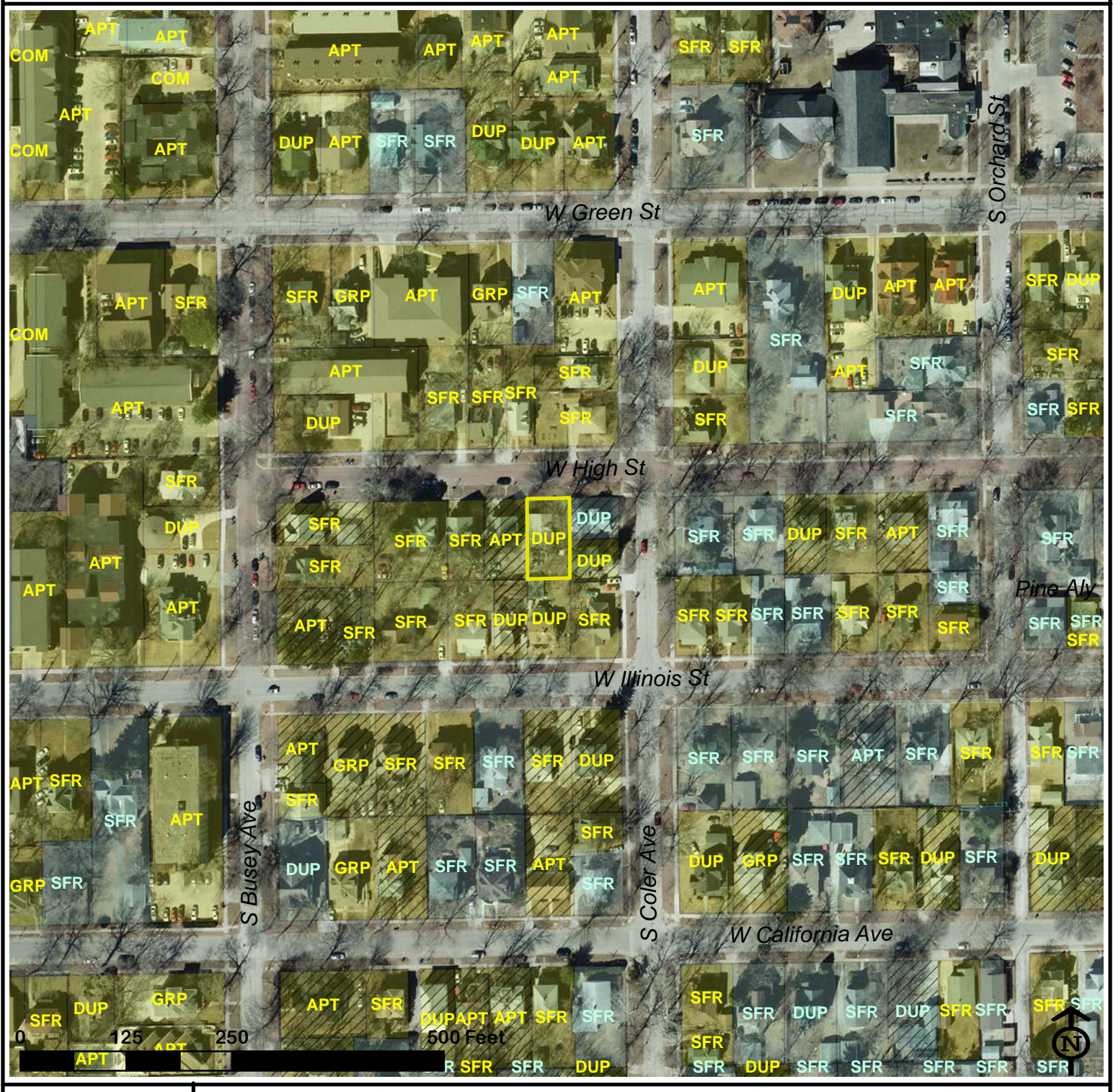
Exhibit A: Location & Existing Land Use Map