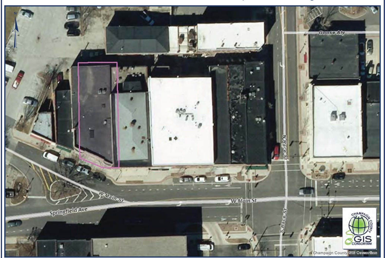
Exhibit C - 118 W Main Street - Stephens Building

This map application was prepared with geographic information system (GIS) data created by the Champaign County GIS Consortium (CCGISC), or other CCGISC member agency. These entities do not warrant or guarantee the accuracy or suitability of GIS data for any purpose. The GIS data within this application is intended to be used as a general index to spatial information and not intended for detailed, site-specific analysis or resolution of legal matters. Users assume all risk arising from the use or misuse of this application and information contained herein. The use of this application constitutes acknowledgement of this disclaimer.