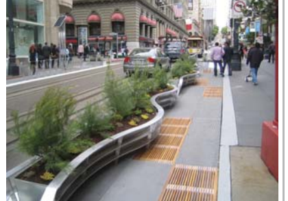
Exhibit D: Examples of Curbanas