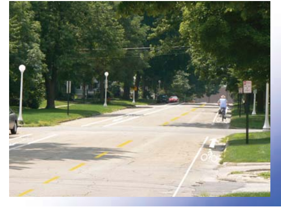
Figure 8.26: Future View: Broadway Avenue south of Illinois Street