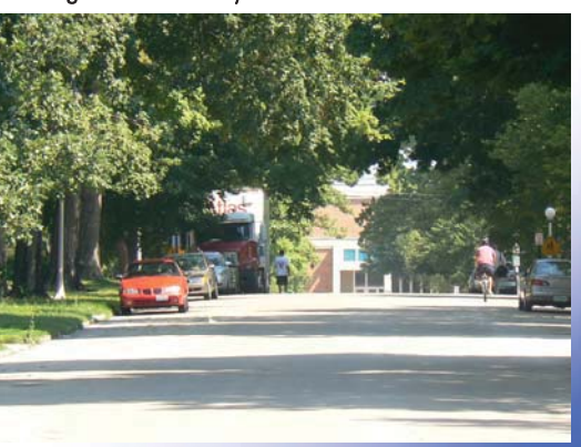
Figure 8.27: Existing View: Broadway Avenue north of Washington Street