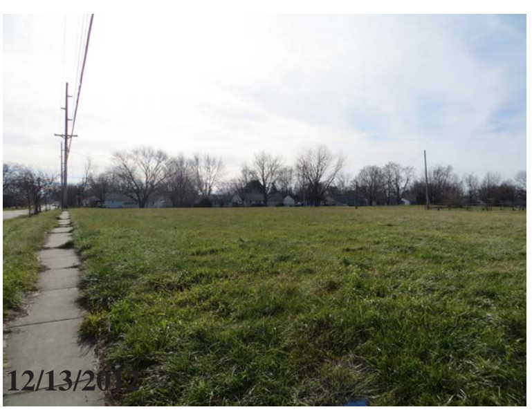
6) N Goodwin Avenue - looking south