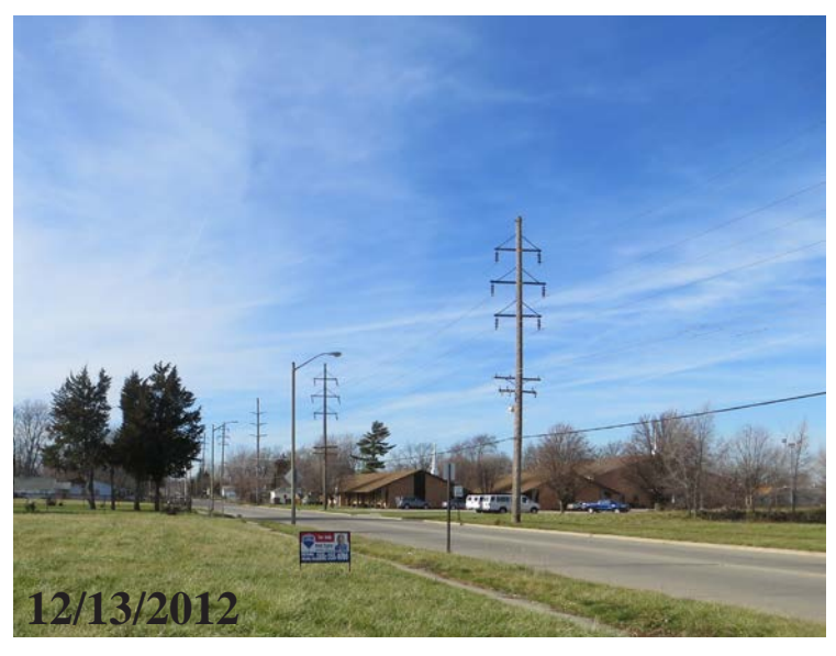
4) W Bradley Avenue - looking west