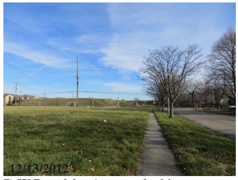
7) W Beardsley Avenue - looking east towards Illinois American Water Company wellhead