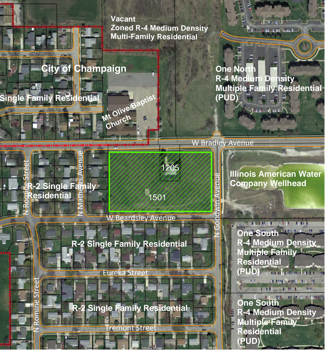
Exhibit A: Location and Land Use Map