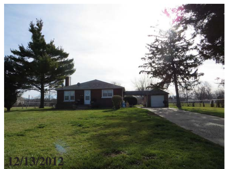
3) Single family rental property at 1205 W Bradley Avenue