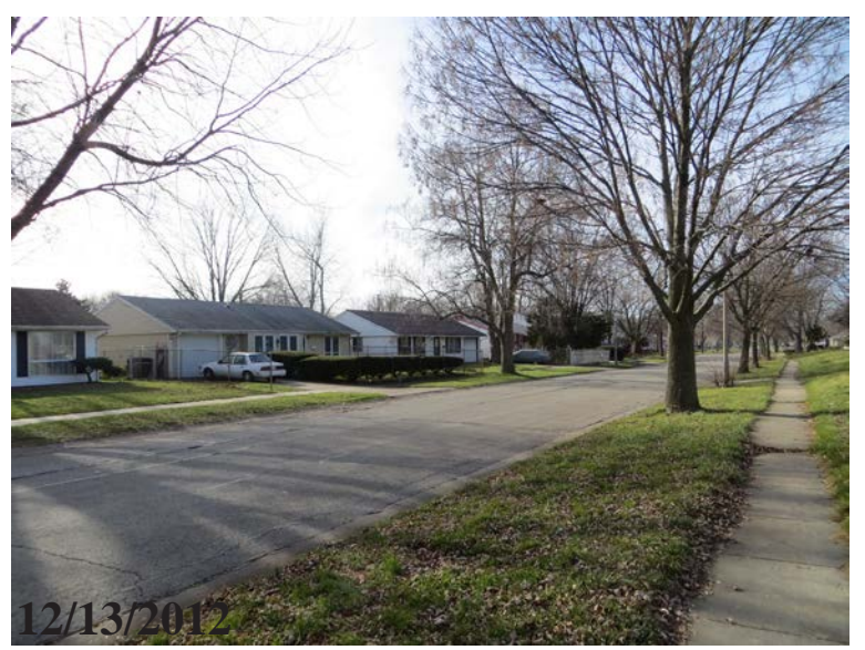
8) W Beardsley Avenue - looking west