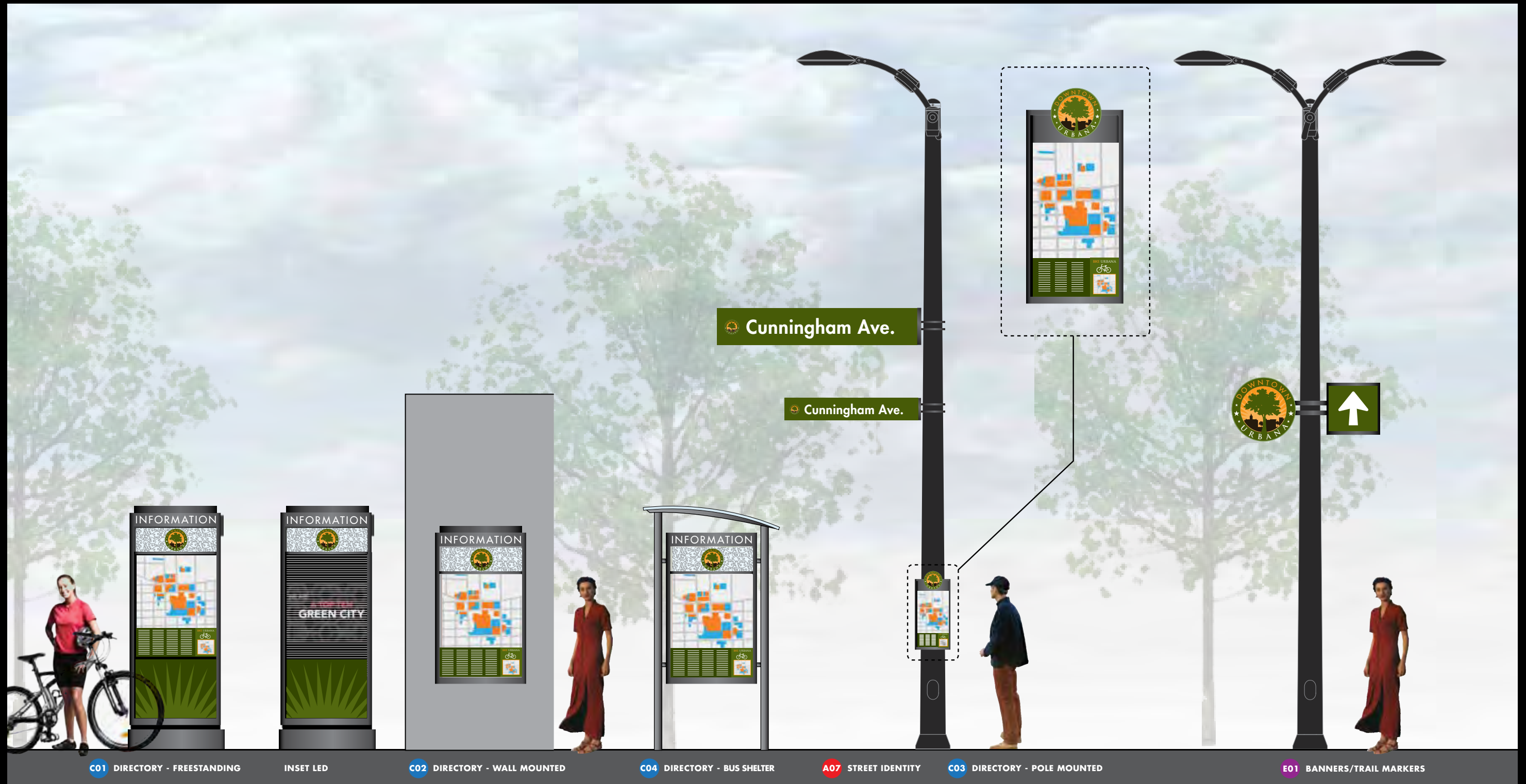
C01 DIRECTORY - FREESTANDING