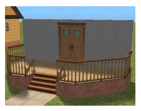
Example of inset porch stairs

The subject property is in an older neighborhood where front porches are an important design feature that helps to maintain the character of the neighborhood. There are some alternative ways in which the design of the porch and the porch stairs could be changed to allow the stairs to meet the minimum required 10-foot front yard, such as setting the stairs into the porch as in the simulation at right. Another alternative would be to remove the stairs on the Birch Street frontage and turn the stairs on the Green Street frontage sideways. While both of these alternatives would allow the petitioner to satisfy the required minimum front yard setback, neither of them would be ideal for the character of the neighborhood