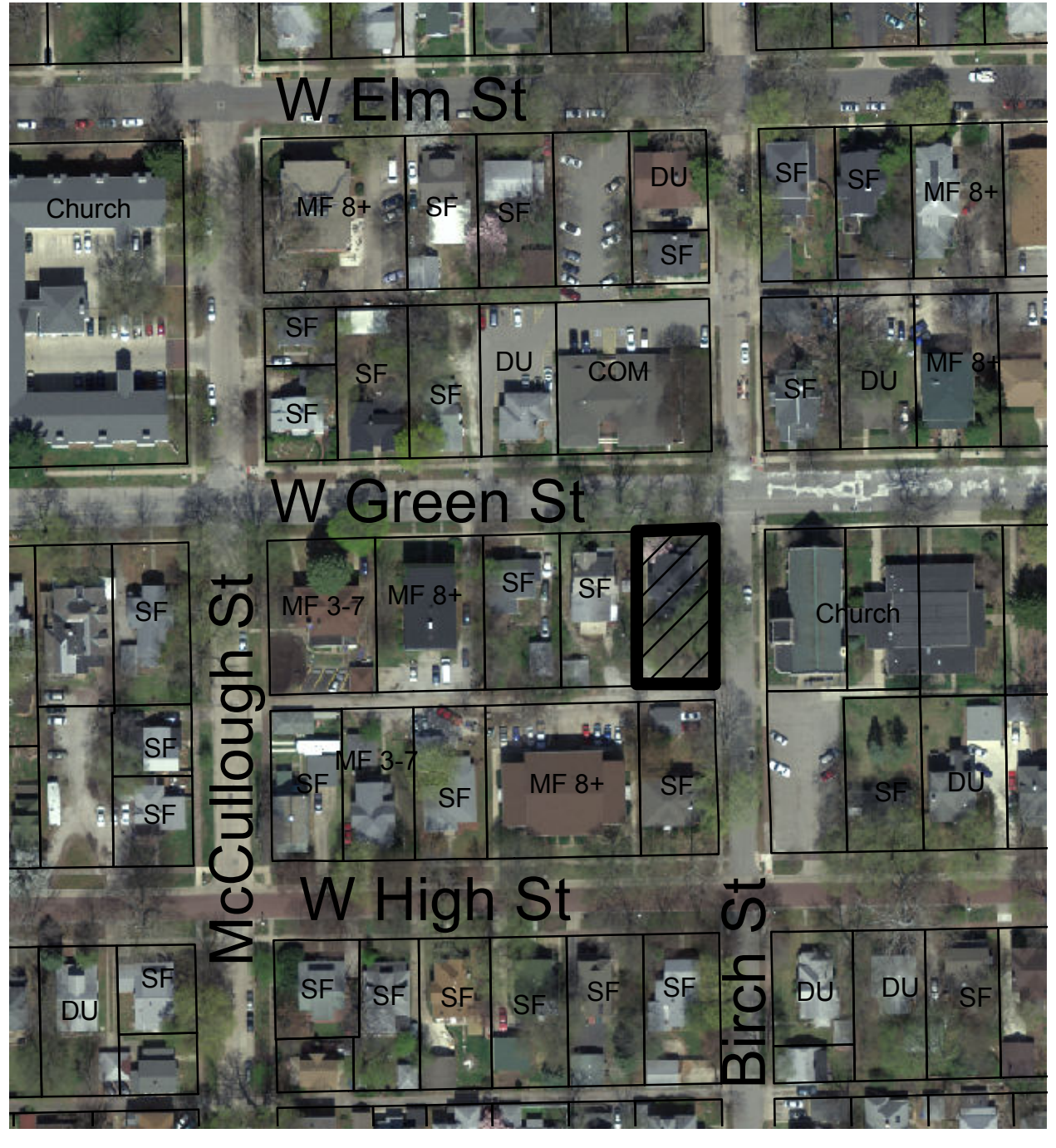
Exhibit A: Location & Existing Land Use Map