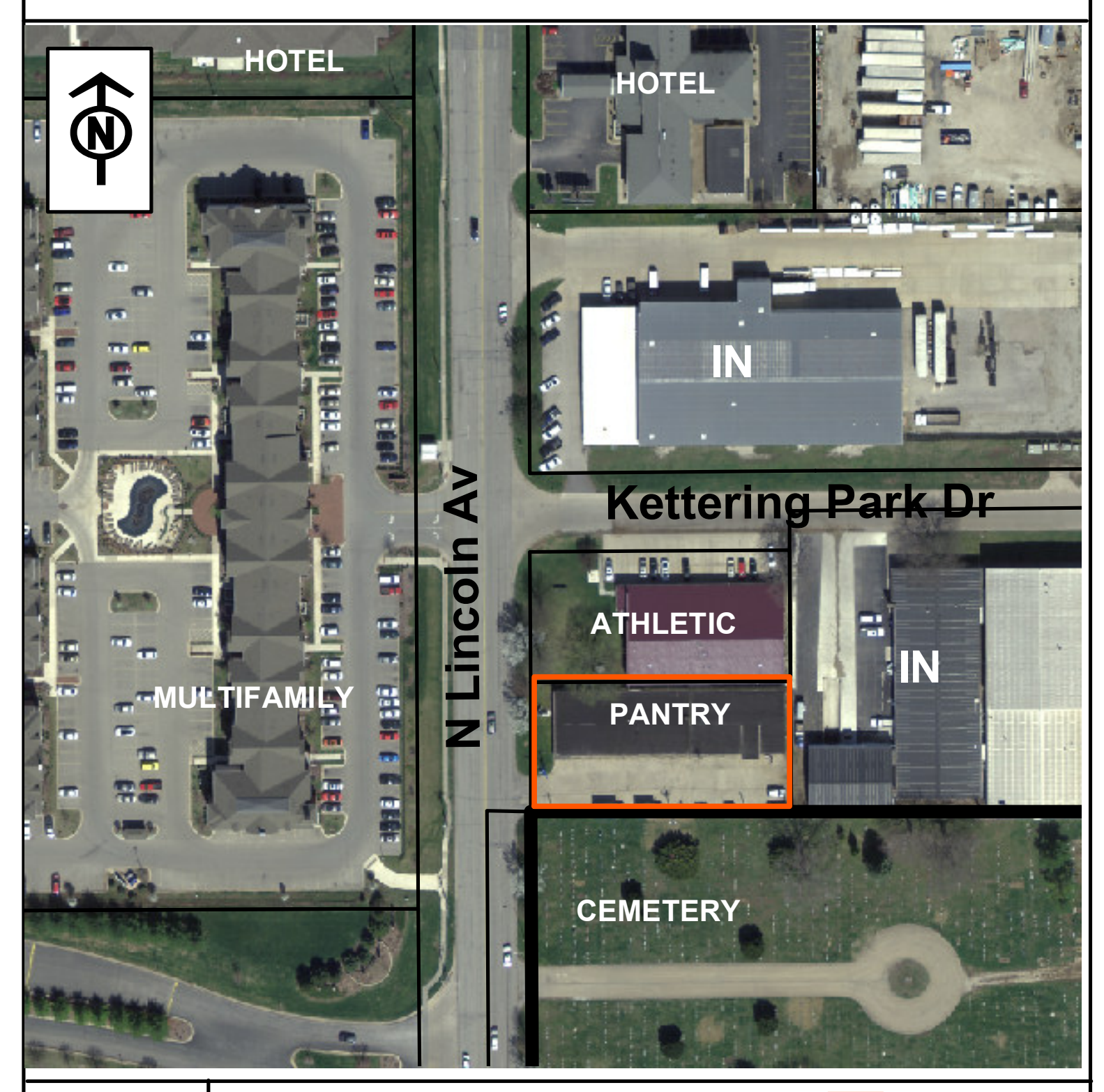
EXHIBIT A: Location Map & Existing Land Uses