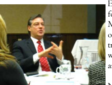
Exhibit and performance space should be included for the Festival of the Month to reach travelers. MidCoast Fine Arts currently houses an art gallery on the second floor of the center. "What if we transformed the gallery into a working artist's studio where visitors could watch unique Quad Cities artists at work?" he pondered.

Noting that 32,000 cars every day pass the welcome center on Interstate 80, Young said while some of the cars are local residents, the community's tax base would grow if just an extra 10 percent of cars going by would stop and extend their stay in the Quad Cities.