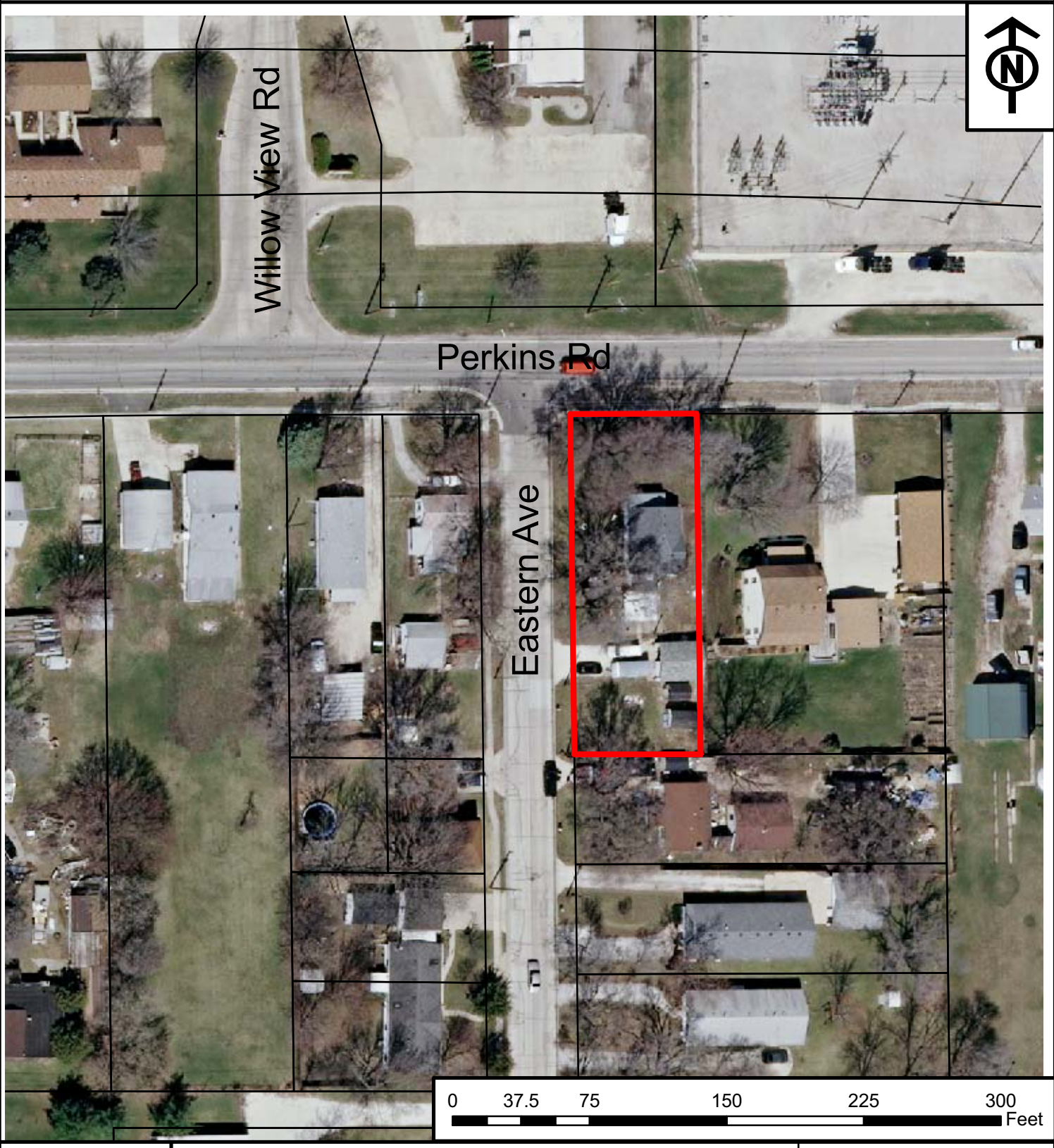
Exhibit A: Location Map