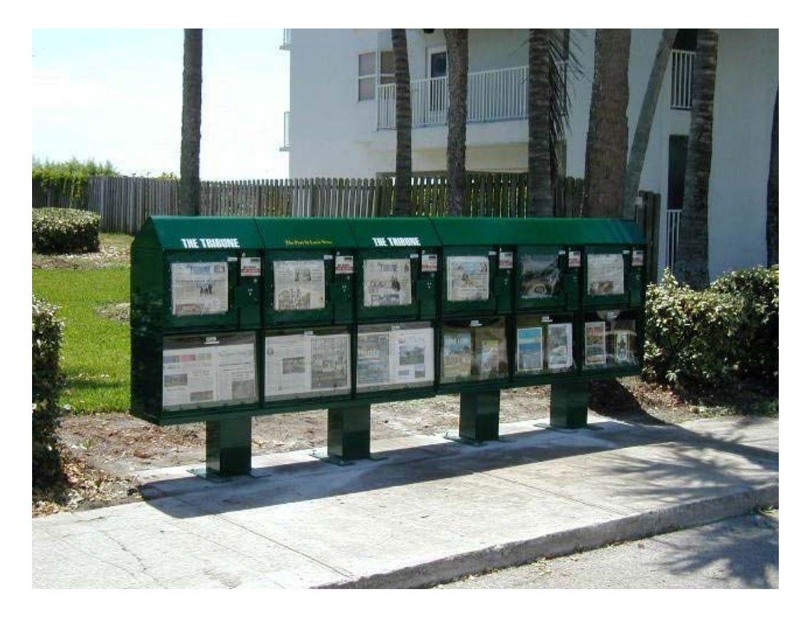
Approved news rack by Rak Systems, Inc.