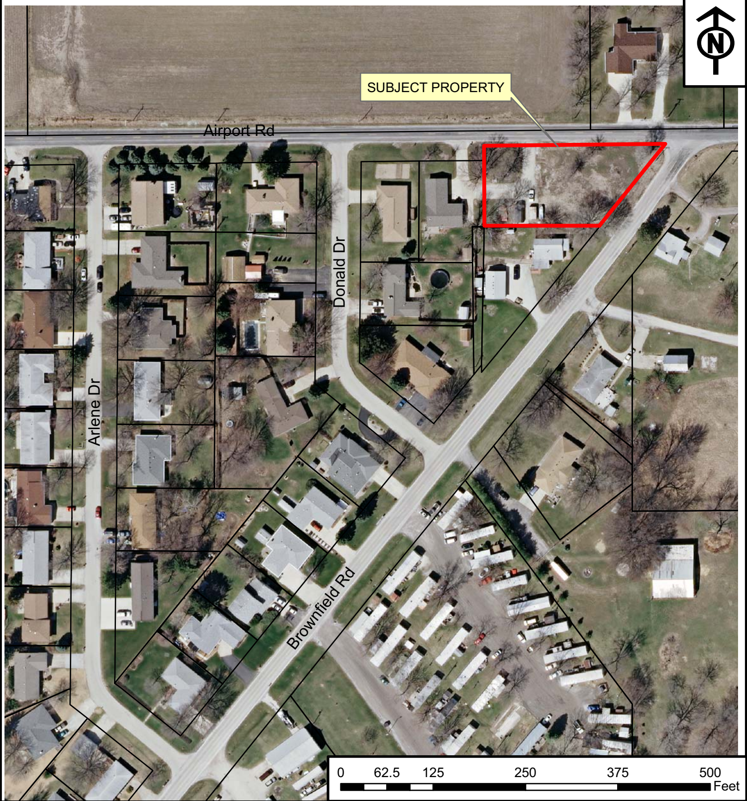
Exhibit A: Location Map