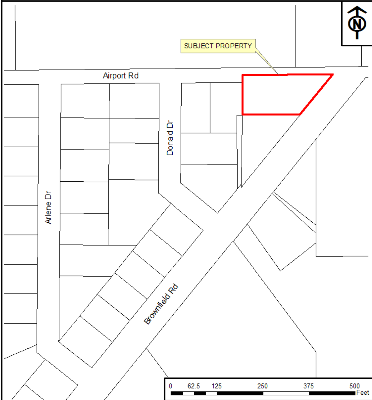
Exhibit 2: Location Map