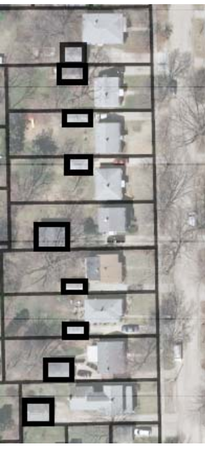
800 Block of Urbana St Note the regular placement pattern of the garages on or near the side property line.

The image on the left is of the west side of the 700-800 block of N. Coler Avenue, north of Carle Hospital. The lots on this block are 57 feet wide and have a regular pattern of the garages being on or near the north property line. The image on the right is of the west side of the 800 block of Urbana Street, in Historic East Urbana. The lots here are between 45 and 48 feet wide, far short of the required width of 60 feet for a lot platted today. Here three of the garages are located on or very near the north property line, and six on or near the south property line.