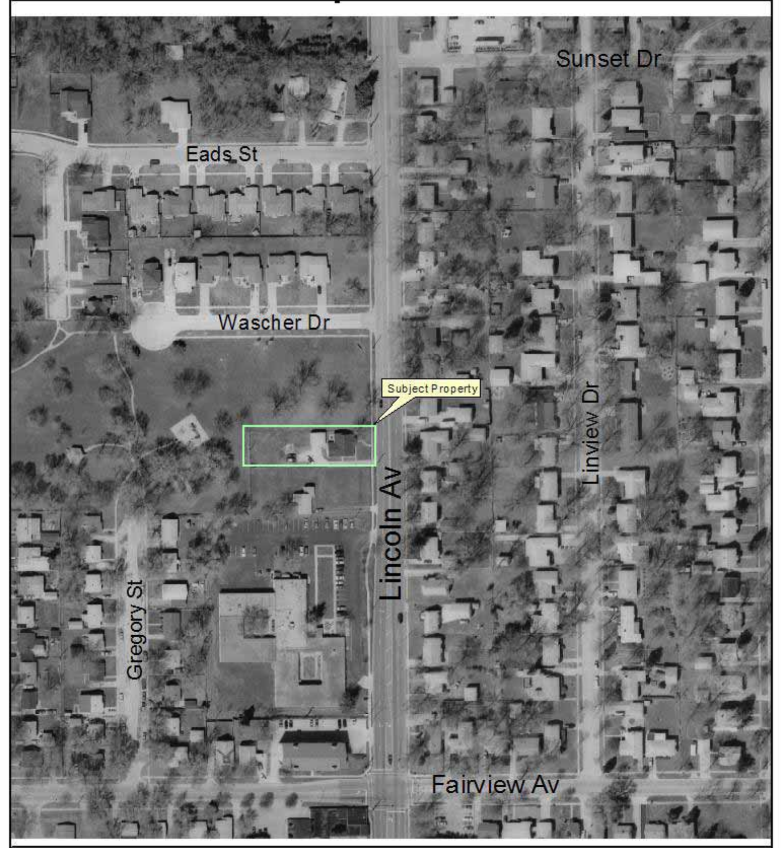
Exhibit C: Aerial Map