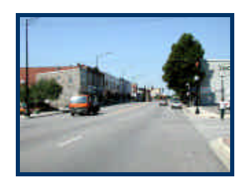
East side of Downtown Champaign, where on-street parking for businesses is limited.