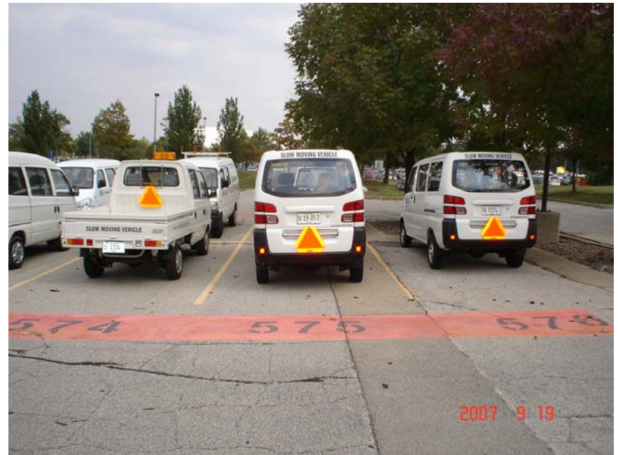
Neighborhood Vehicles for the University District