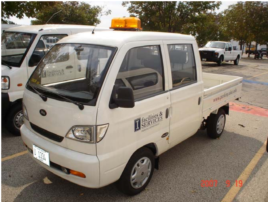
Neighborhood Vehicles for the University District