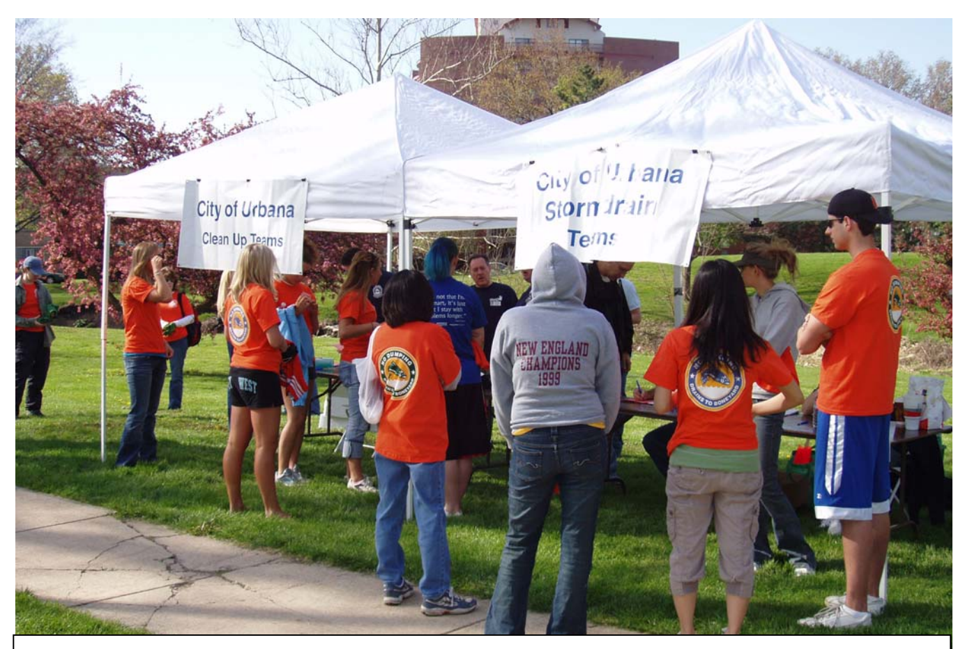
Registration at Scott Park