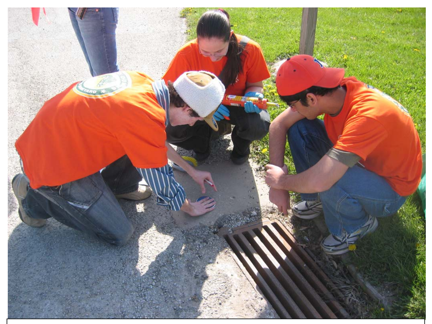
Storm Sewer Inlet Medallion Installation