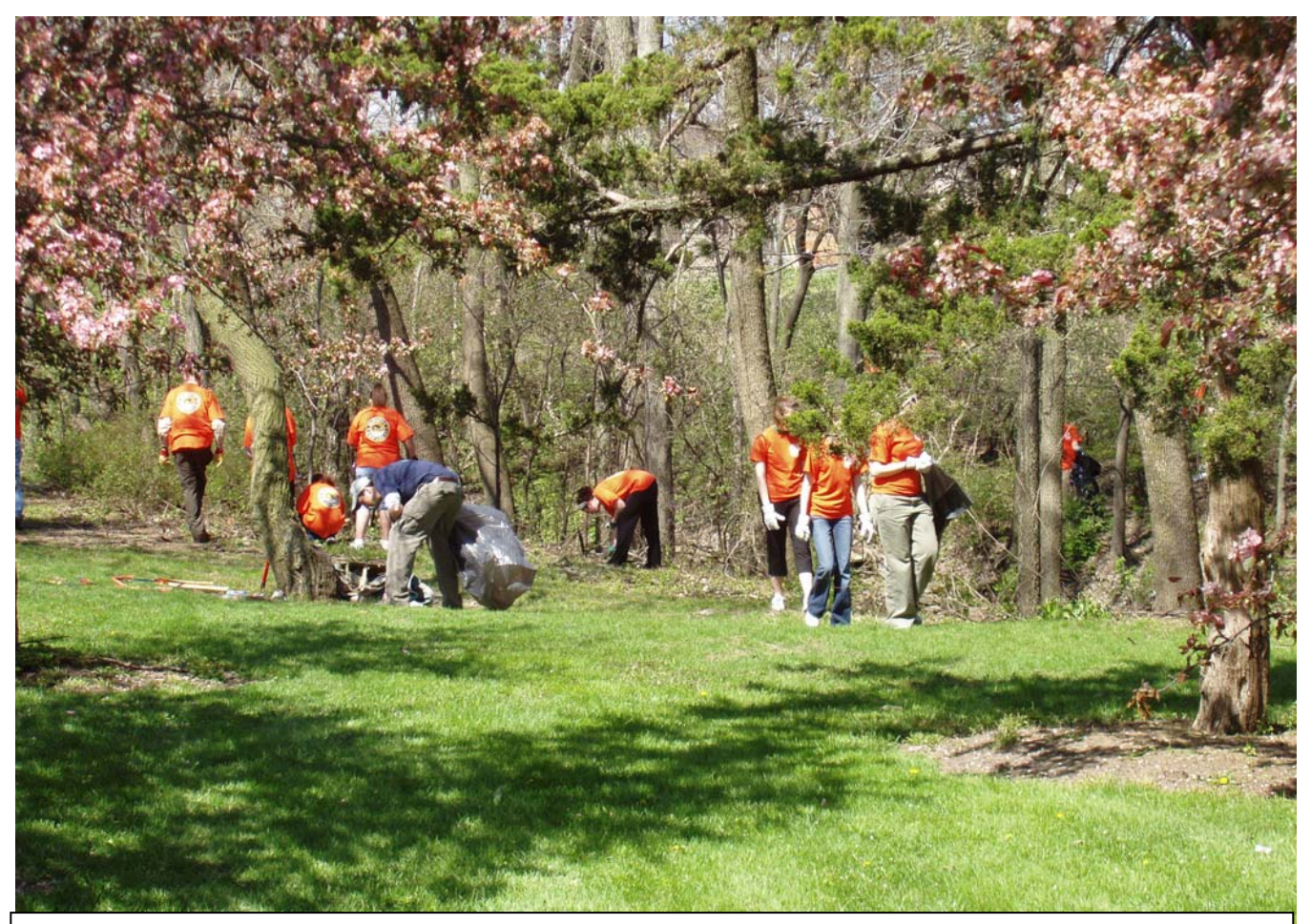
Boneyard Creek Stream Invasive Species Removal and Trash Pick-Up