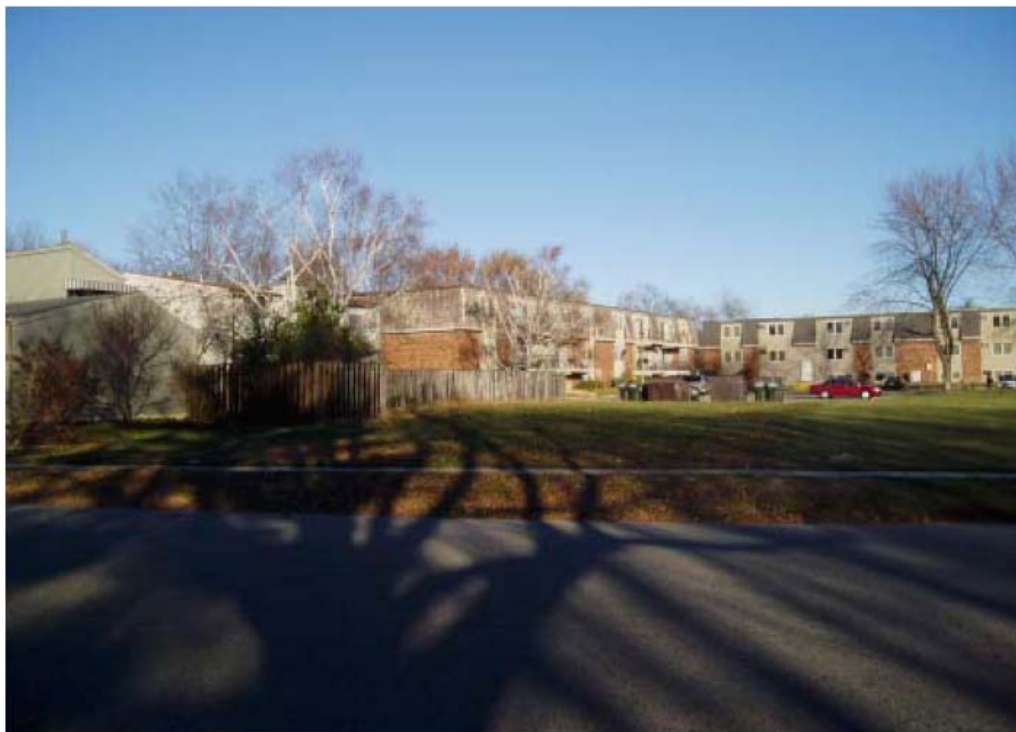
Facing east, the site of the proposed relocation, 1708 South Cottage Grove. Florida Avenue Apartments are in the back;