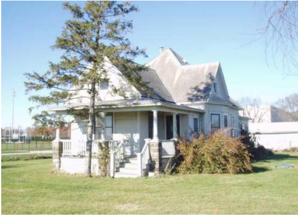
Facing north, the Poultry House at 1402 St. Mary's Road

1402 ST. MARY'S ROAD TO 1708 SOUTH COTTAGE GROVE AVENUE