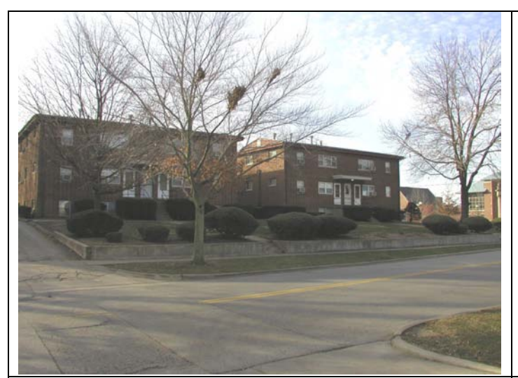
View from Illinois at 807 and 809 W. Green