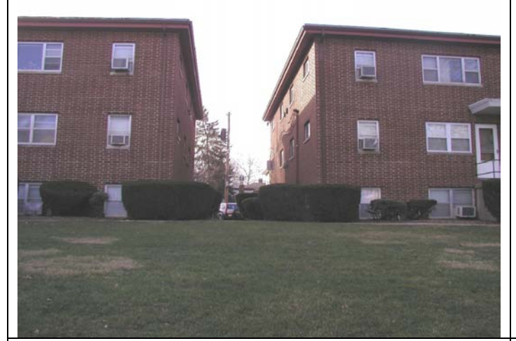
View south from Illinois Street sidewalk at space between buildings.