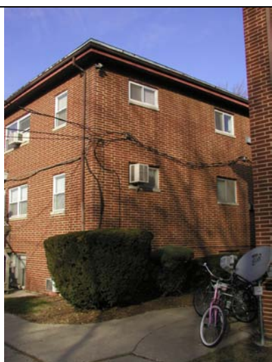
View at lease area corner of 809 W. Illinois