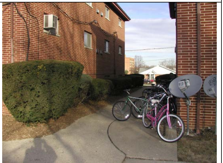
View north toward Illinois Street, lease area at left.