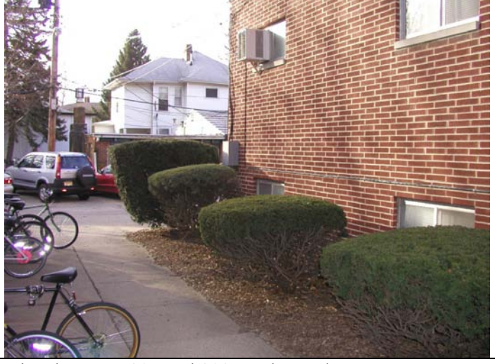
View between 807 and 809 south past lease area to parking lot.