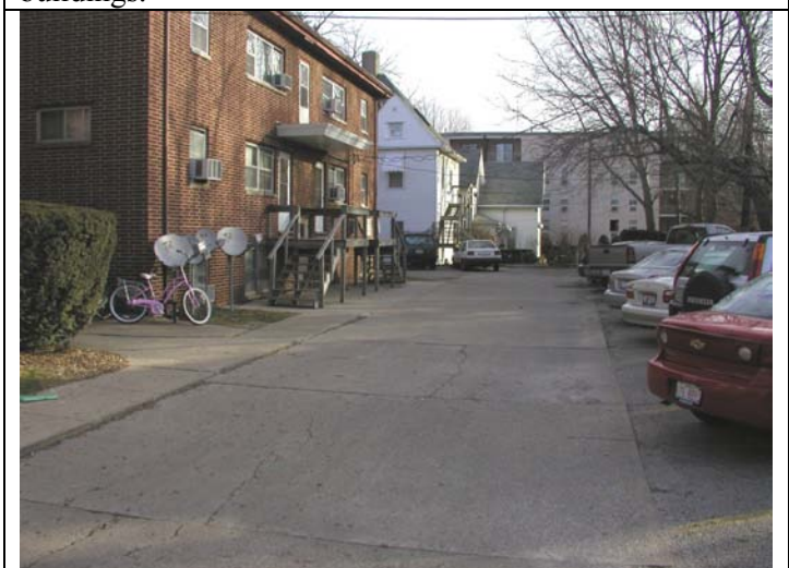
View east from Lincoln to parking. Lease area includes bush on left.