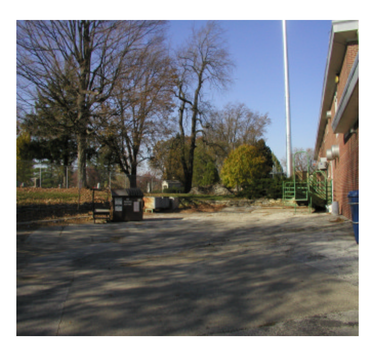
Tower Site-Facing North