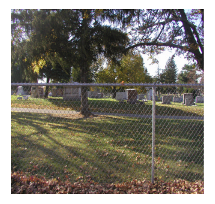
Facing West from the Tower Site