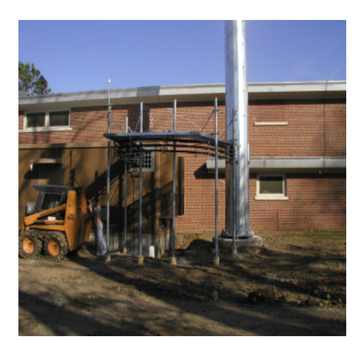
Cell Tower Site-Facing East