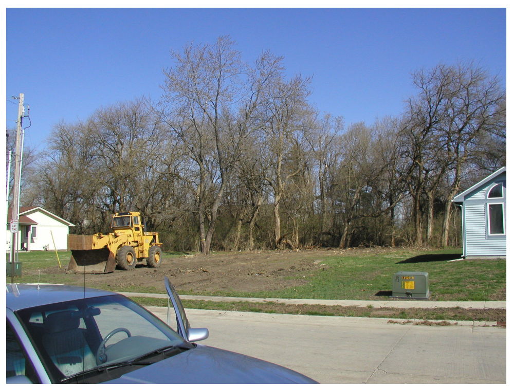
914 W. Eads St.