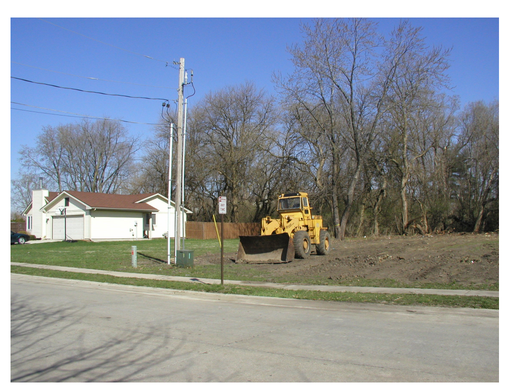
916 W. Eads St.