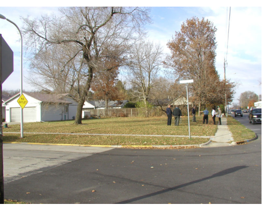
902 Wascher Drive