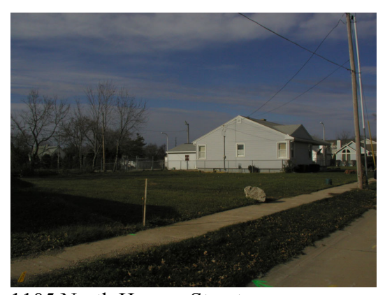
1105 North Harvey Street