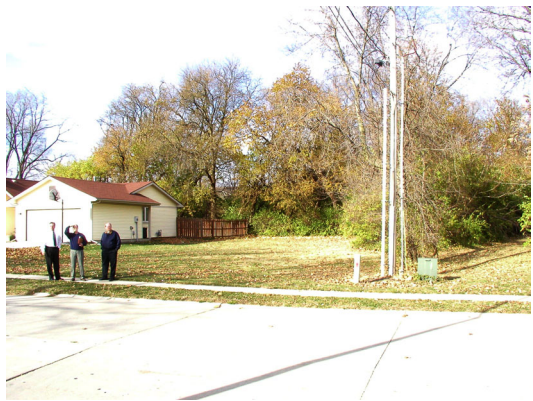
916 West Eads Street