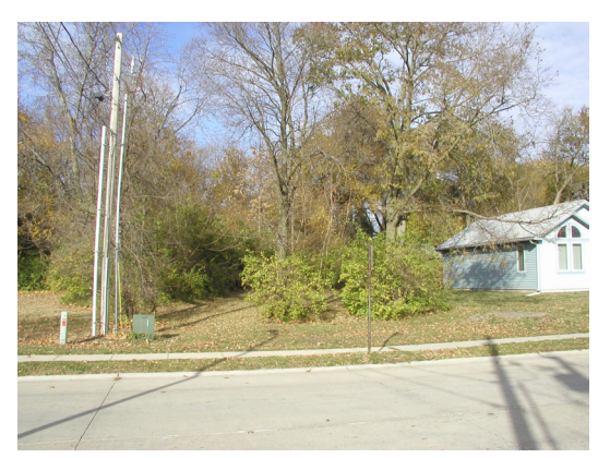
914 West Eads Street: future site of Urbana School District house construction