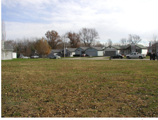
908-910 West Eads Street (looking from the Northwest corner)