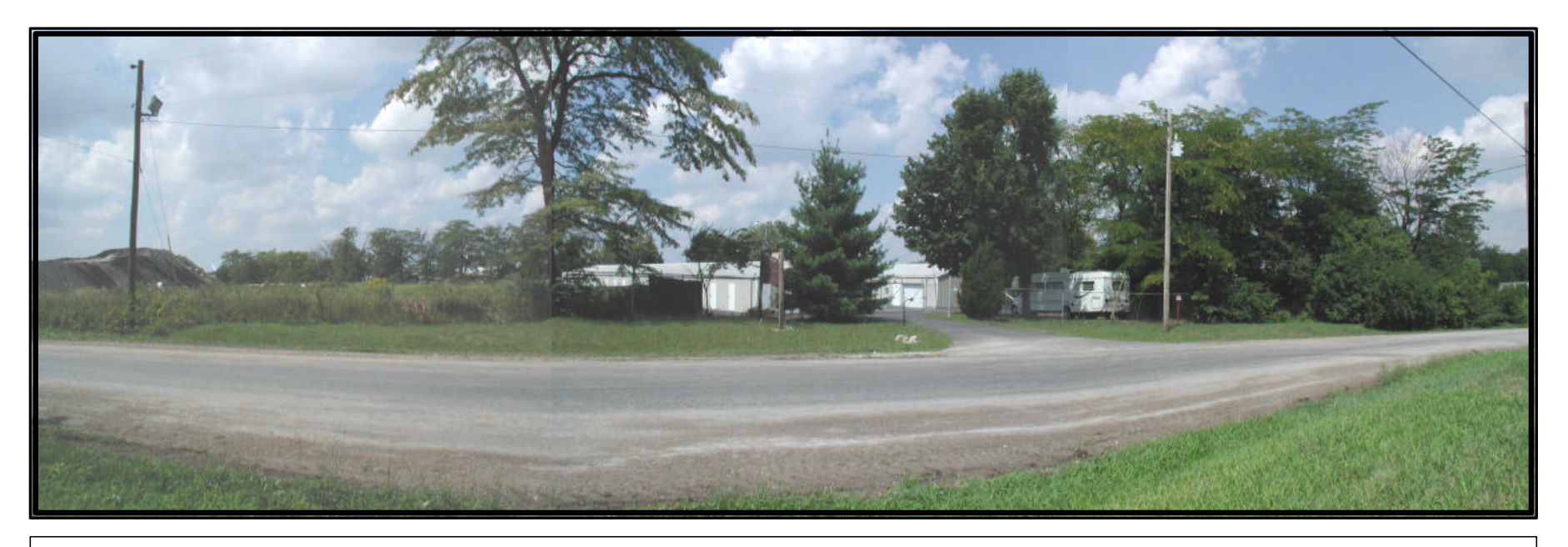
3201 N. Lincoln Avenue - Lincolnwood Warehouse Systems: View from Dunn Farm looking southwest to northwest across Lincoln Avenue. At left is storage area for recycled concrete. At right is future extension of Lincoln Ave. over Saline Ditch.