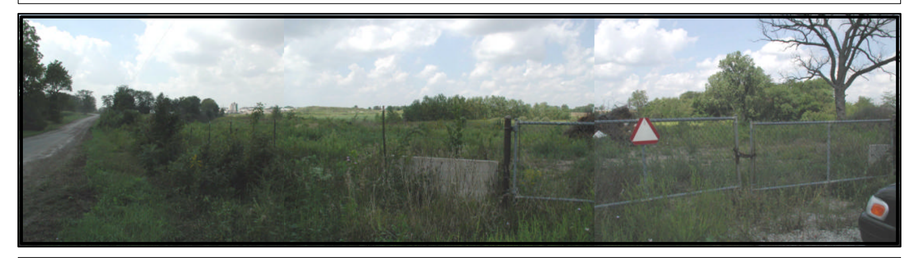
3301 N. Lincoln Avenue – Barber & Deatley vacant tract: View looking south to west. Lincoln Avenue (the "angle" that intersects with Oaks Road) is on left. Far left is Dunn Farm. At right is gated drive that is in City and leads to Saline Branch. A common location for illegal dumping has now been clean up and is under control. CN Railroad yards are at horizon.