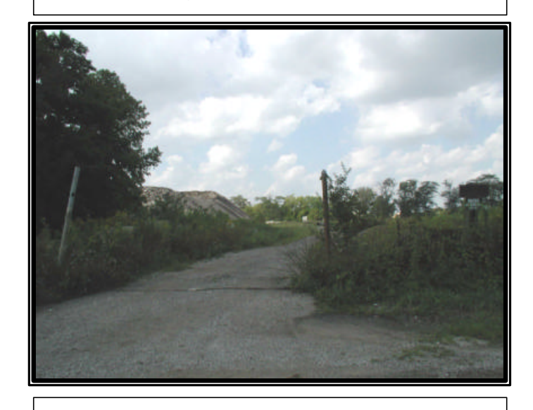
View looking west along access drive just north of 3107 N. Lincoln Avenue.