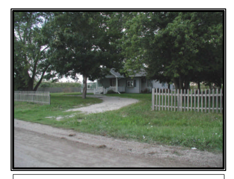
View looking southwest at 3107 N. Lincoln Avenue, a single family residence.