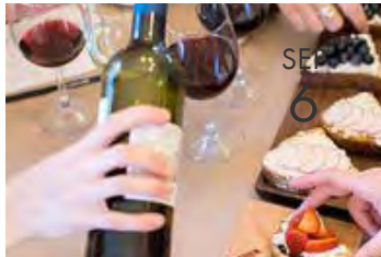
Lunch Wine Tasting