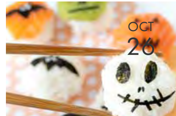
Monster Sushi + Sake