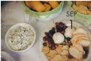
First Friday Evening