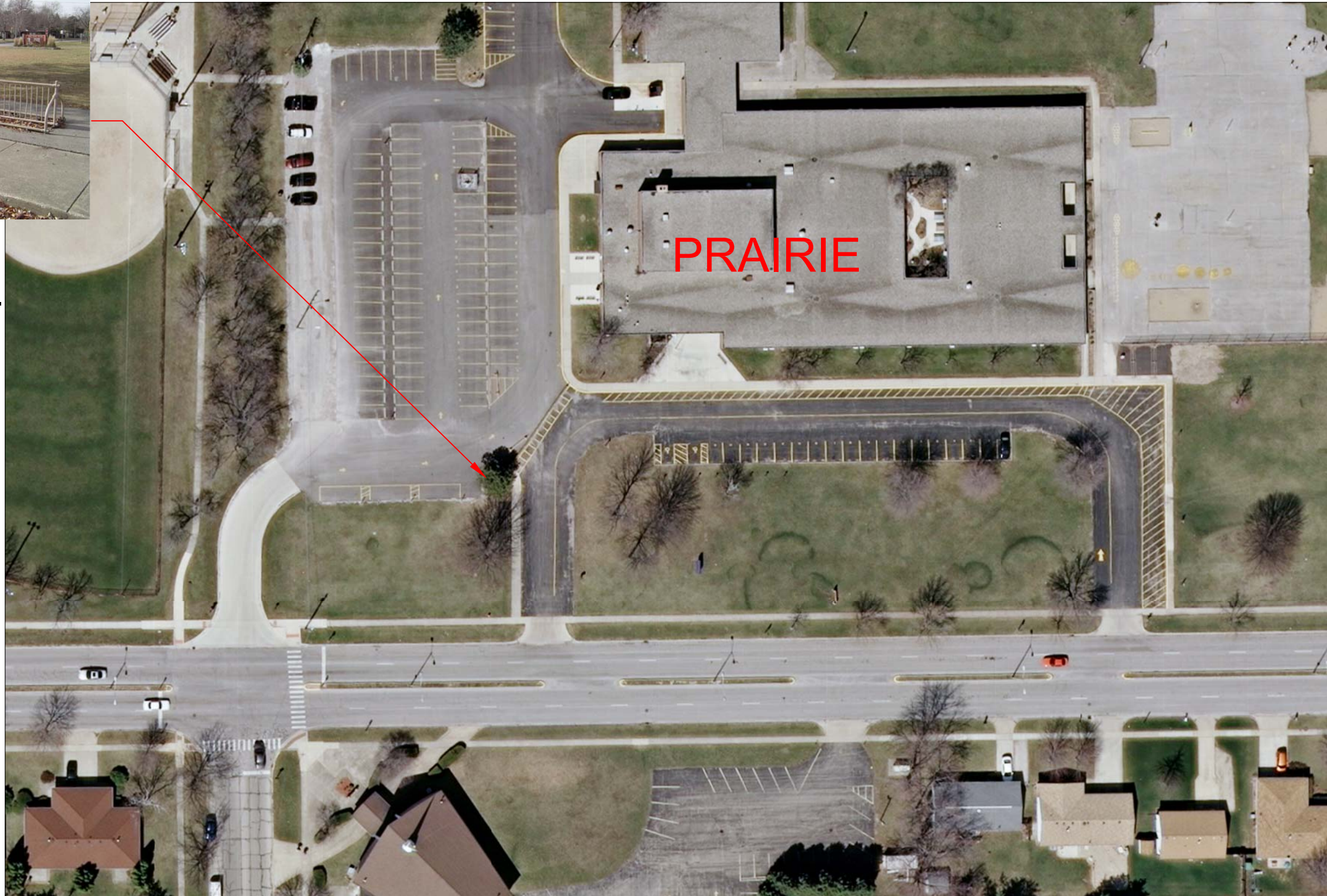
ATTACHMENT A - BIKE RACK LOCATIONS