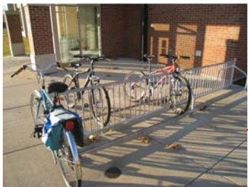
Existing "comb" style bike racks.

Note bikes parked on end and with wheel over rack to avoid damage to wheel.