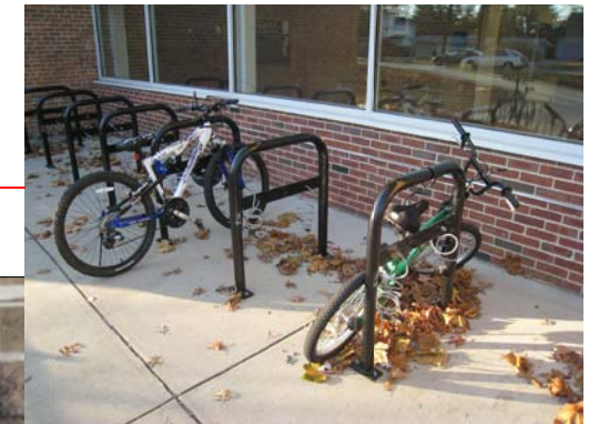
Existing u-racks style bike racks.