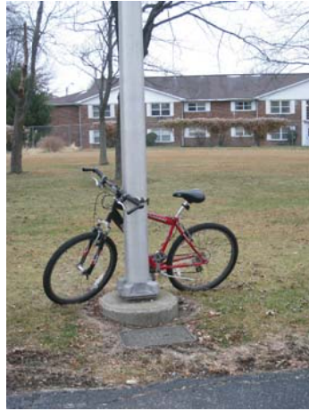
Bike locked to light pole on front side of building.