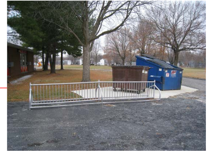
Existing "comb" style bike racks on back side of building near dumpsters.