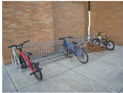
Existing "comb" style bike racks.