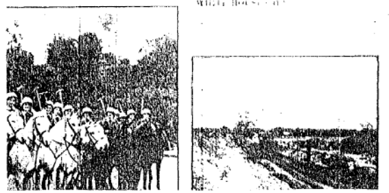
BEAUGEARD F. Urbana Newspaper Rack Project 2007