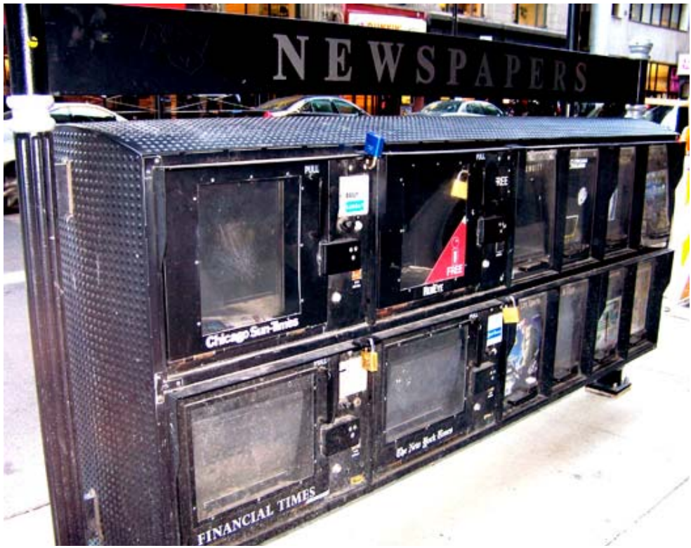
Newsracks in the Chicago Loop