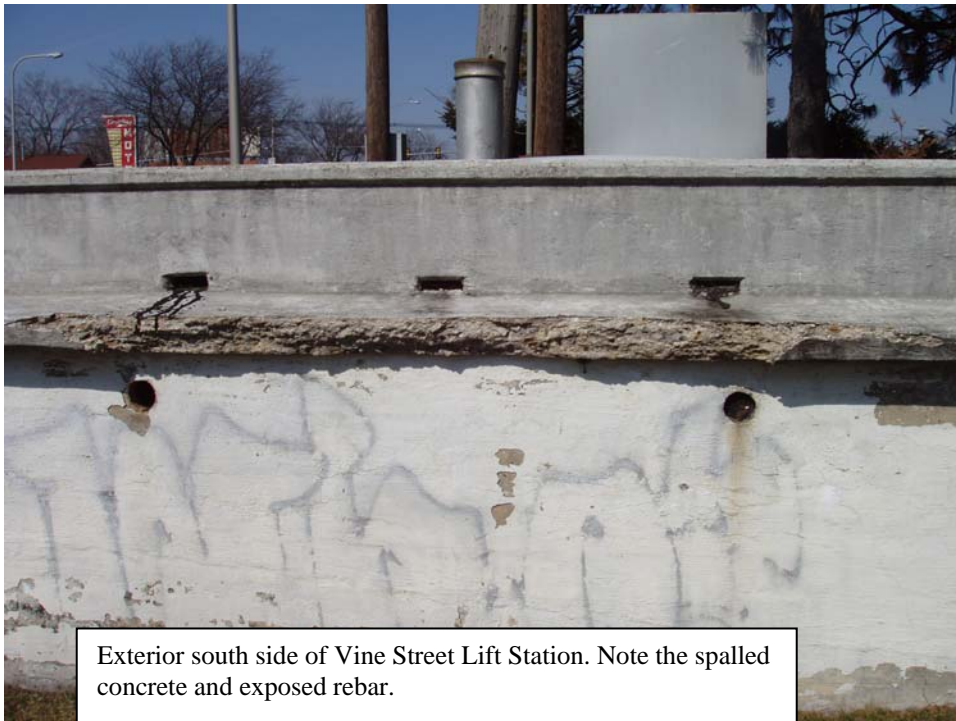
Exterior south side of Vine Street Lift Station. Note the spalled concrete and exposed rebar.