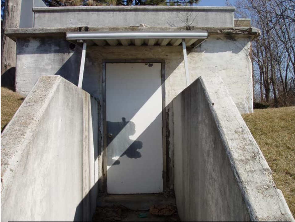
Front of Vine Street Lift Station facing Vine Street. Note deteriorated door, overhang, and retaining walls. Rehabilitation would remove retaining walls, door, and overhang and fill the area with dirt to hide face of lift station. Access would be through the roof.