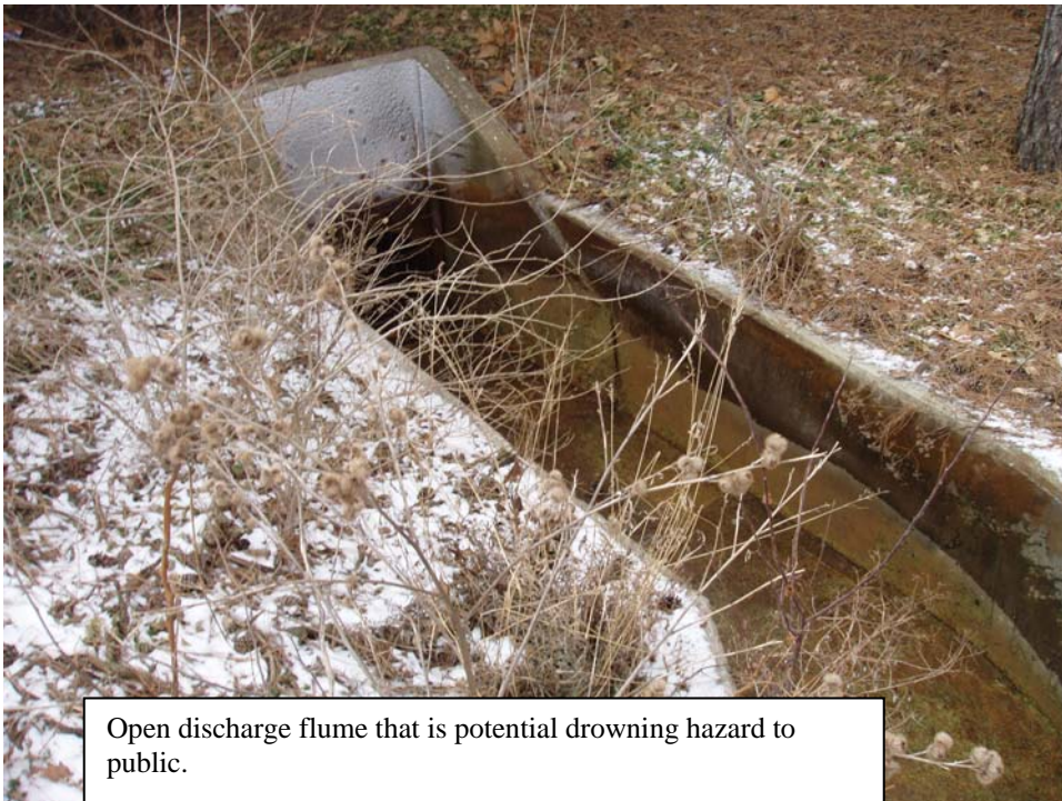
Open discharge flume that is potential drowning hazard to public.