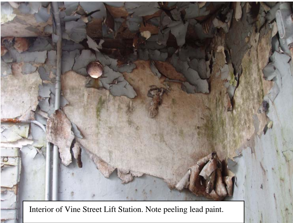
Interior of Vine Street Lift Station. Note peeling lead paint.